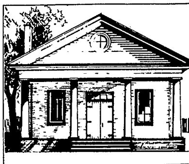
The Town Hall