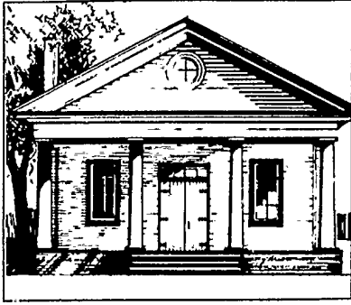
The Town Hall