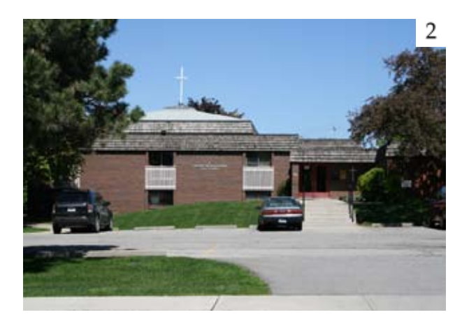
10 Adelaide Street East Toronto, Ontario M5C 1J3

This radial plan is square in shape, based on a central, bisymmetrical composition rather than an axial plan. Often, square plans take the form of a cross-in-square plan, which is usually composed of a square space with a Greek Cross within it. The central portion is often larger than the arms of the cross and is often capped by a dome. Examples: 1. Sharon Temple (Sharon), 2. St. Matthew the Apostle Anglican Church (North York), 3. St. Boniface Roman Catholic Church (Hamilton), 4. Santa Maria Romanian Orthodox Church (Timmins)