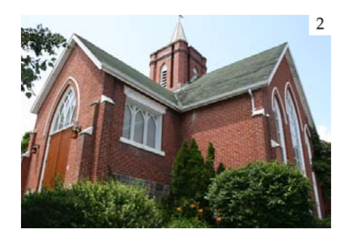
10 Adelaide Street East Toronto, Ontario M5C 1J3

Almost always utilizing a floor plan that is Cruciform or Greek Cross, the crossing tower massing requires an intersection of two halls at right angles with a tower that rises above the roof line by at least a full storey. This massing is rare in smaller houses of worship and tends to require considerable scale in order to be feasible. Towers are typically square in plan and form the dominant feature of the building's roof. Examples: 1. All Saints Kingsway Anglican Church (Toronto), 2. Trinity Anglican Church (Bradford), 3. St. Sava Serbian Orthodox Church (Mississauga), 4. St. George Ukrainian Orthodox Church (Fort Frances)