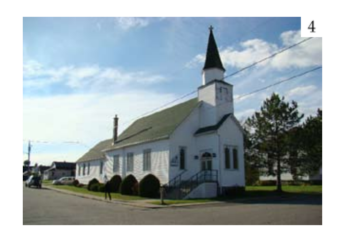
10 Adelaide Street East Toronto, Ontario M5C 1J3

A central tower is one that is centrally located on the façade, rising above the roof line by at least a full storey. The central tower is typically the main entrance to the building. The buildings are normally symmetrical on either side of the tower axis. Examples: 1. St. Thomas Pioneer Anglican Church, 2. Erindale Presbyterian Church (Mississauga), 3. St. John's Roman Catholic Church (Tay), 4. St. Andrew's United Church (Blind River)