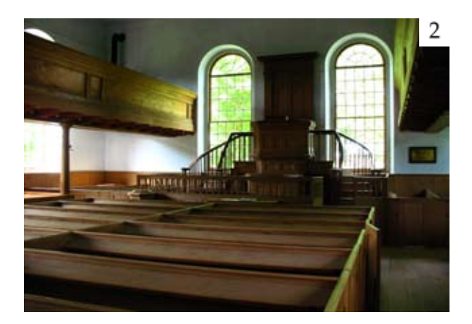
10 Adelaide Street East Toronto, Ontario M5C 1J3

The simplest of plans, it is rectangular in shape, with or without aisles, and generally uniform in height throughout. In hall churches, there are no transepts and no clerestory. The nave and aisles are covered by a single-span roof. Examples: 1. King Christian Church (King), 2. Old Stone Church (Beaverton), 3. St. Paul's Presbyterian Church (Hamilton), 4. St. Leonard's Anglican Church (Rockingham)