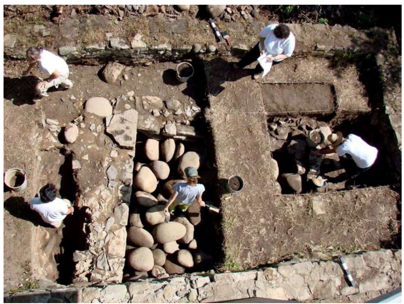
Macdonell-Wiliamson House excavation, East Hawkesbury