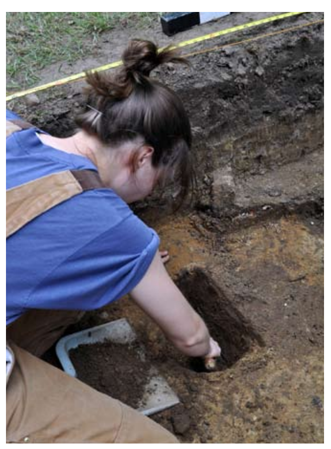
McMartin House excavation, Perth

An owner could request an archaeological assessment for a particular property. No assessment can be undertaken on a property without the consent of an owner. An approval authority may ask for an archaeological assessment as a condition of a Planning Act, Cemeteries Act (Revised), Aggregate Resource Act, Environmental Assessment Act or Ontario Heritage Act application – or any other form of site alteration that might otherwise impact a known archaeological site or an area of recognized archaeological potential.