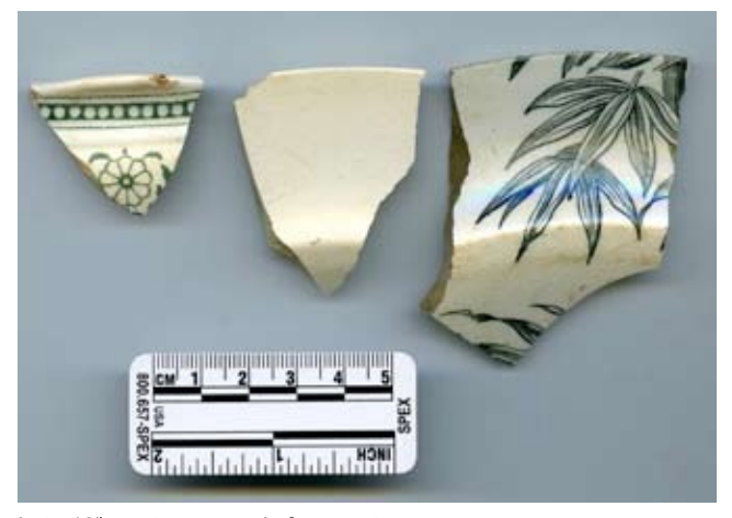
Late 19th-century ceramic fragments

An archaeological site is any property that contains an artifact or any other physical evidence of past human use or activity that is of cultural heritage value or interest (see Ontario Regulation 170/04 ).