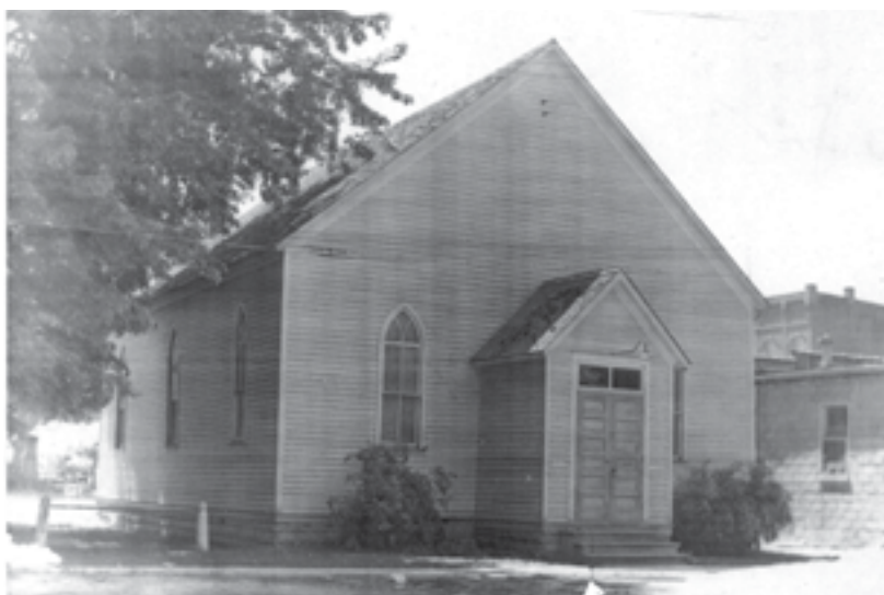
First Regular Baptist Church (1857), Dresden

Since 1953, over 1,200 blue and gold plaques have been unveiled by the Provincial Plaque Program – one of the Ontario Heritage Trust's best-known activities. These plaques commemorate significant people, places and events in Ontario's history.