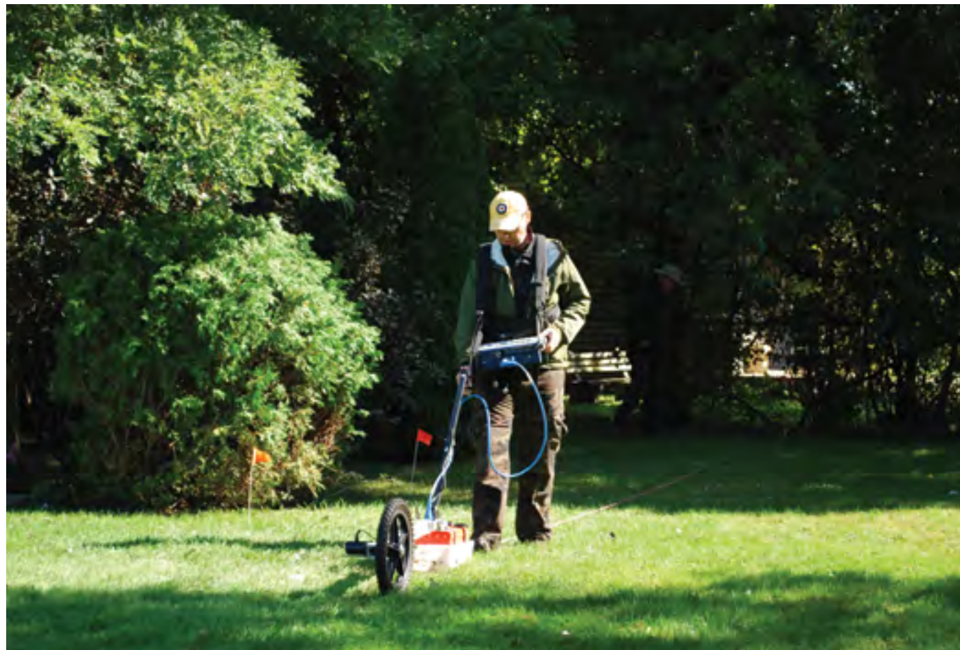
Using ground penetrating radar at the Henson Family Cemetery in 2011.