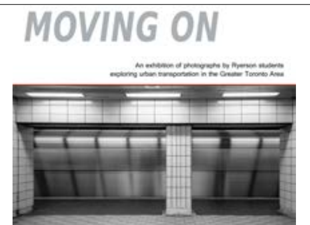
Moving On at the Elgin and Winter Garden Theatre Centre until April 3, 2014, through the RBC Emerging Artists Project.