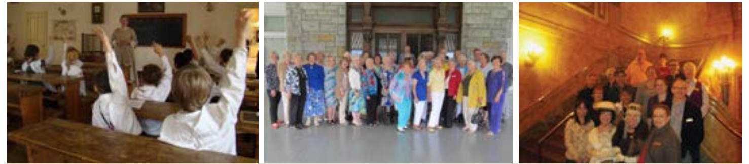
Photos from left: students participating in a school program at Enoch Turner Schoolhouse; members of the Friends of Fulford Place Association; Elgin and Winter Garden Theatre Centre volunteers.