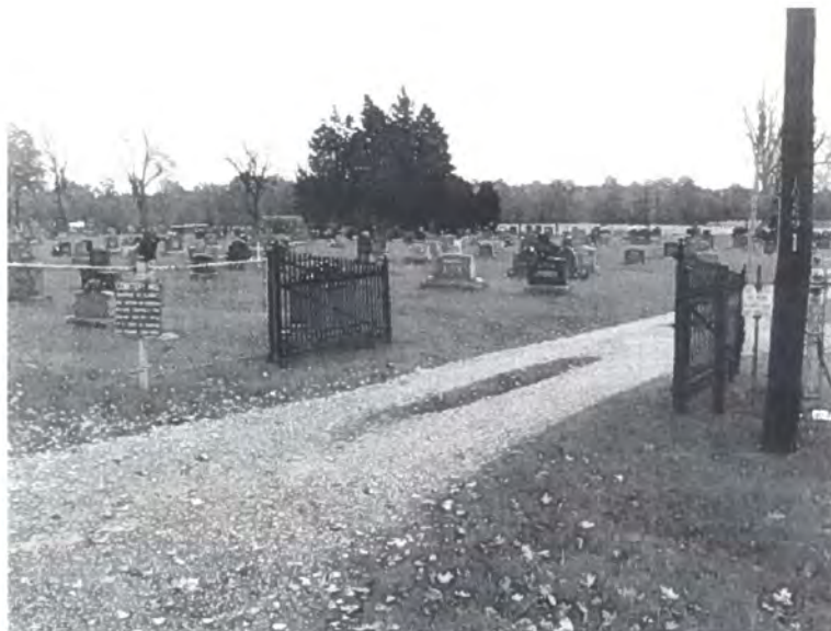
The metal gates at the western driveway entrance