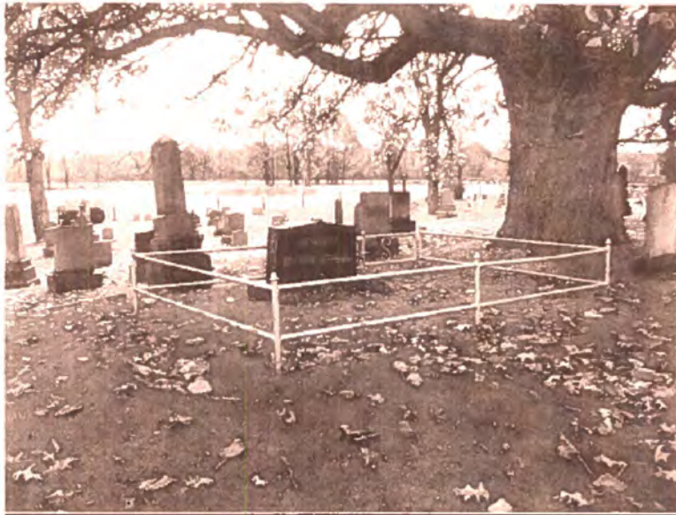
Small metal fencing and gate around a family plot