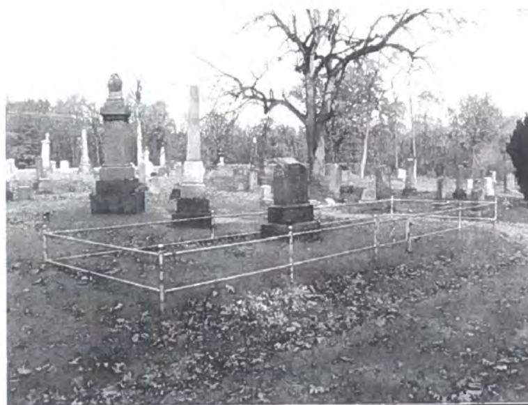
Small metal framed fence and gate around a family plot