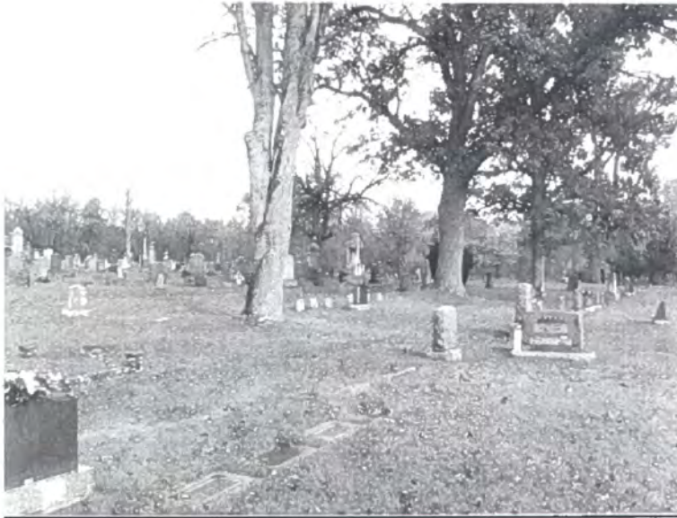
Looking north-east from the south-west corner of the original section