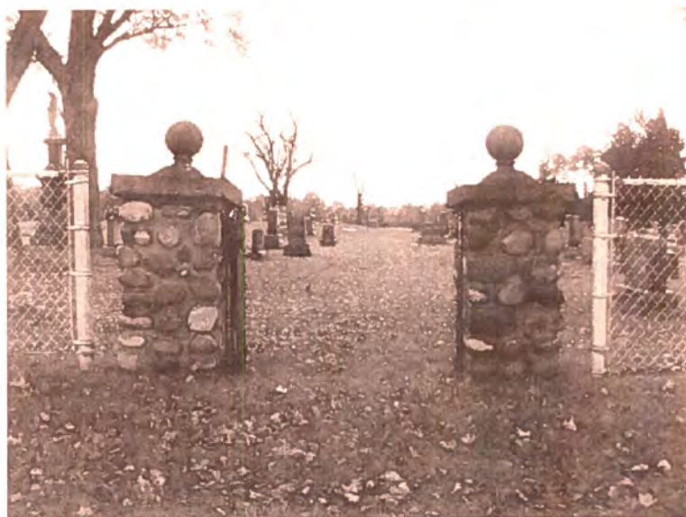
The stone gateposts and steel gate that mark the walking entrance