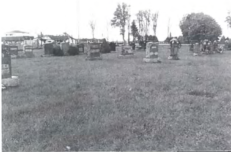
Looking north-west of the new section