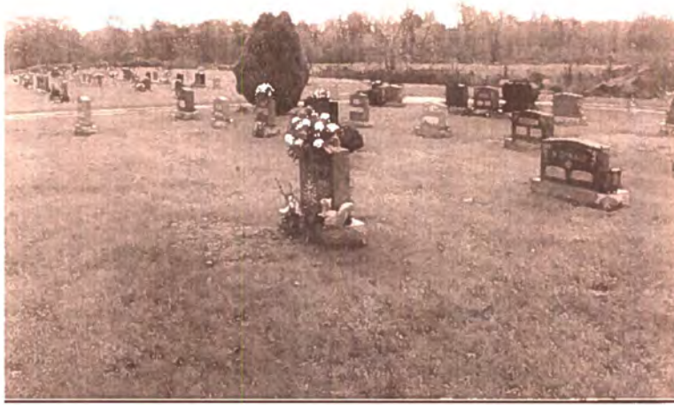
Looking south-west of the new section