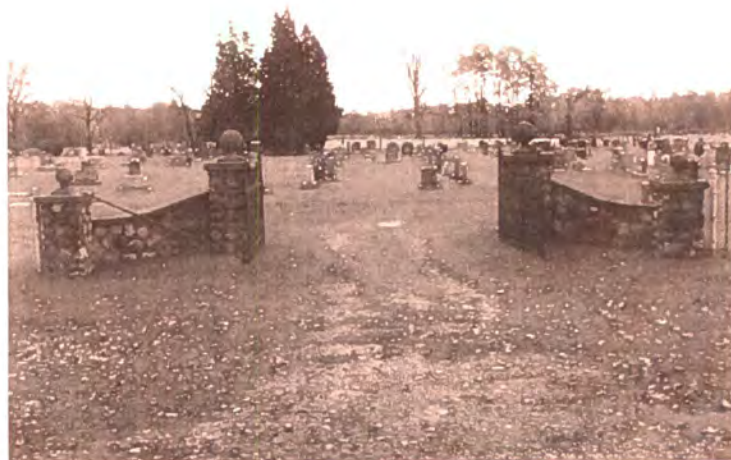
Stonewalls and steel gates to the second entrance to the east