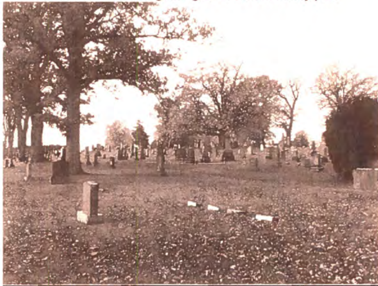
Looking north-west from the south-west corner of the original section