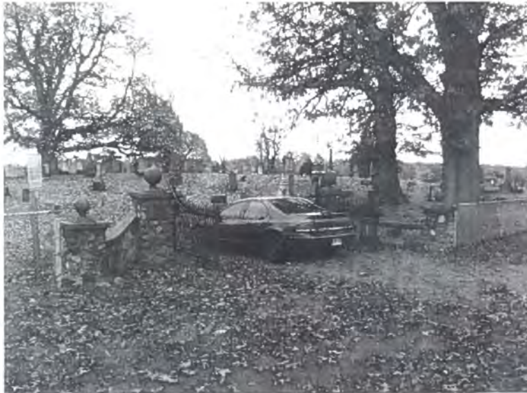
Stone walls and steel gates at the eastern driveway entrance