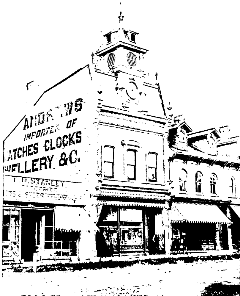
Andrews Jeweller, 1885