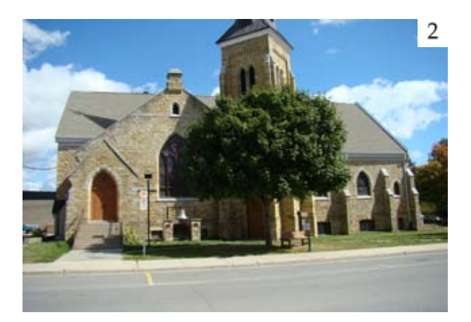
10 Adelaide Street East Toronto, Ontario M5C 1J3

This uncommon massing is often the result of a tight urban site on which the limited space has led to a side entrance in the tower or a somewhat detached tower that acts as a separate form in the overall composition. The tower is typically not centred, but offset to emphasize the asymmetry of the composition. Examples: 1. St Alban the Martyr Anglican Church (Greater Napanee), 2. Grace United Church (Gananoque), 3. Bruce Mines Museum - Former Presbyterian Church (Bruce Mines), 4. St. Paul's Anglican Church (Newmarket)