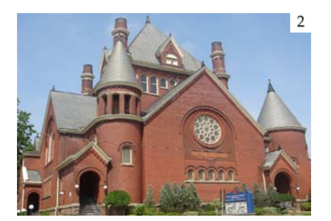
10 Adelaide Street East Toronto, Ontario M5C 1J3

Mimicking the shape of a theatre, this plan includes radiating and often raked seating, and sometimes a large gallery/balcony. Some of these features were made possible through materials and structural innovations, such as mass produced iron, steel and eventually reinforced concrete. This plan was popularized in the last quarter of the 19th century as architectural features common to theatres – including improved site lines and acoustics – were also applied to religious architecture. These compact building masses are well-suited to urban corner placements. This typology was especially useful for evangelical denominations. Examples: 1. Jarvis Street Baptist Church (Toronto), 2. Paris Presbyterian Church (Paris), 3. First Presbyterian Church (Chatham-Kent), 4. Blenheim United Church (Blenheim)