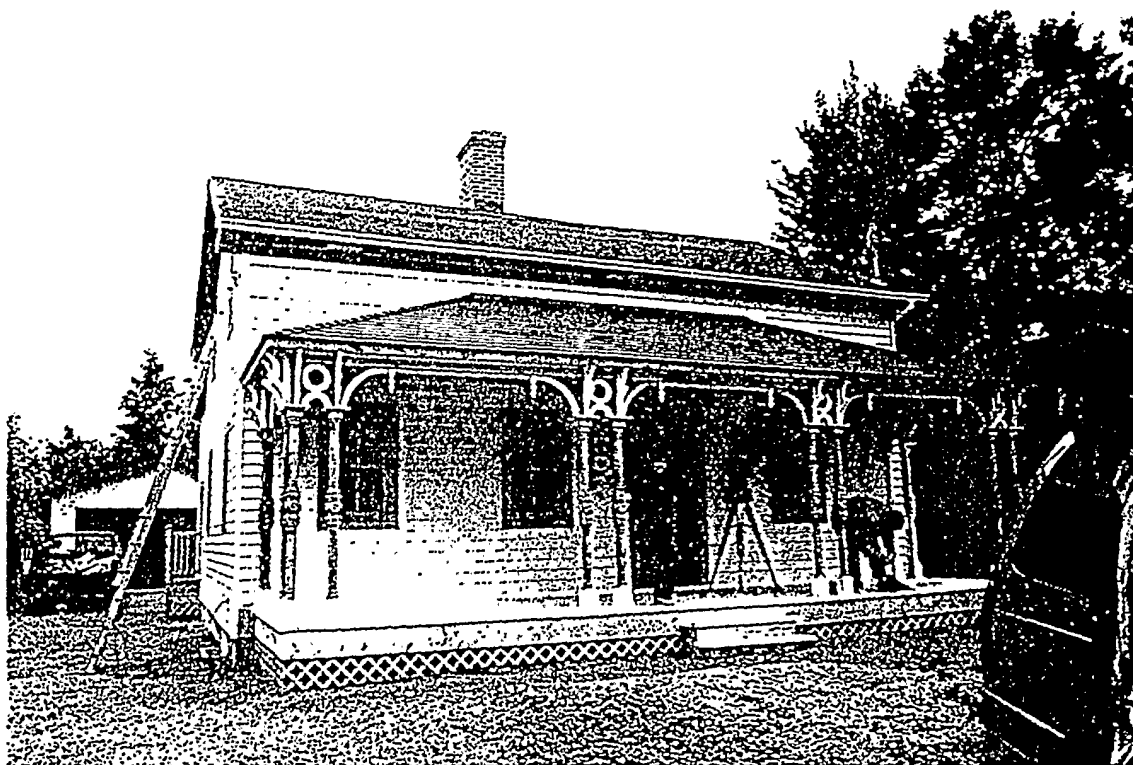
THE JOHN HOOVER HOUSE 101 Clark Avenue Thornhill Formerly 11990 Leslie Street Concession 2, Lot 34 Markham Township