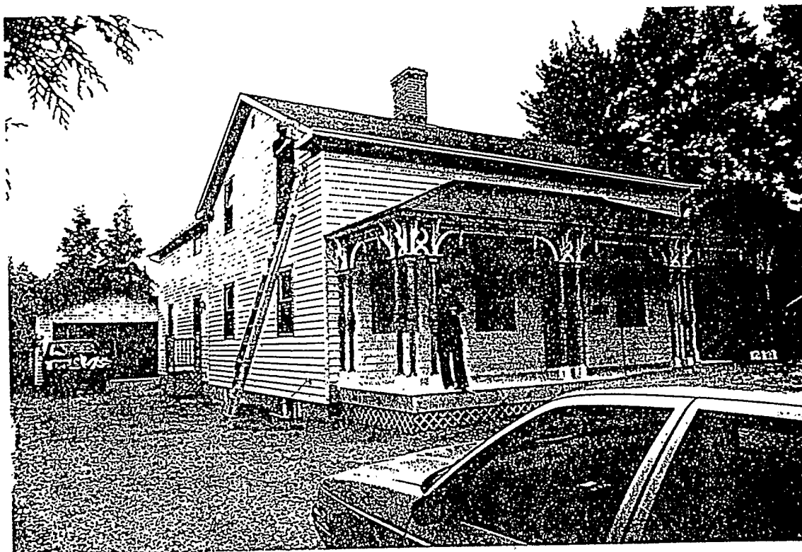
PHOTOGRAPHS OF THE JOHN HOOVER HOUSE, 2000