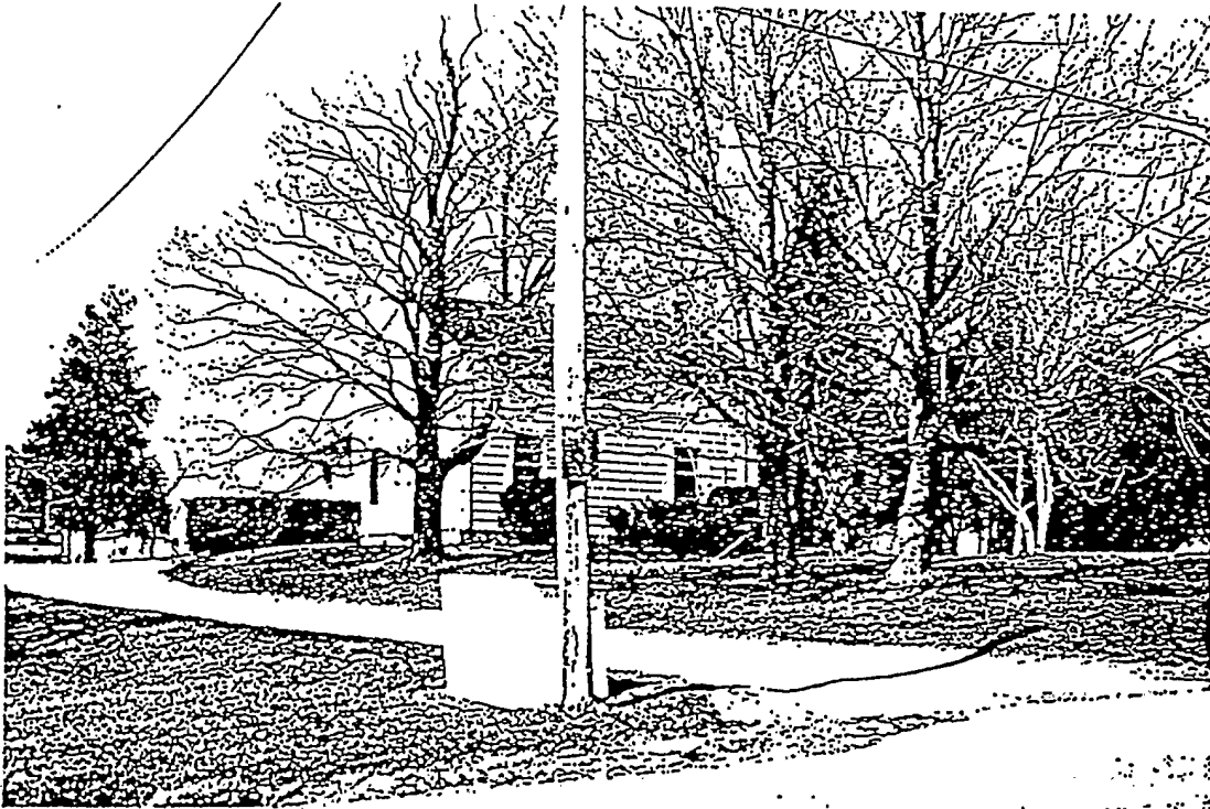
THE ROBERT MILROY JR. HOUSE 7960 Steeles Avenue Part Lot 1, Concession 10 Markham