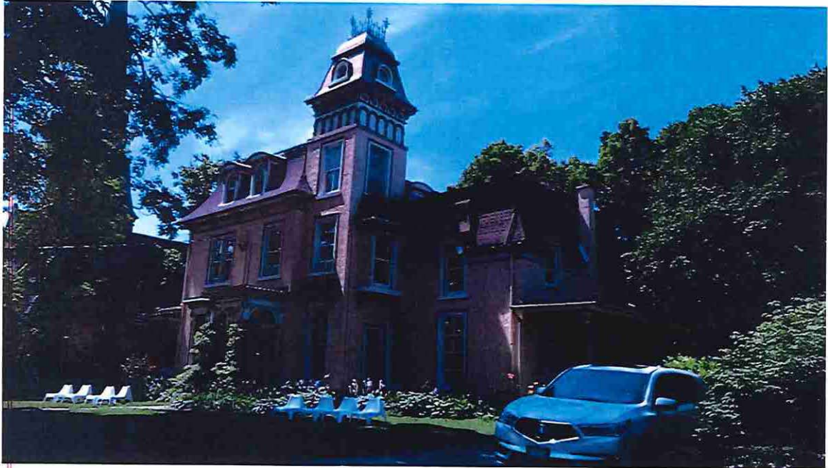
Figure 15: 22 Church Street, in the Italian Villa style, viewed from the northeast (E. Tumak, July 2019).