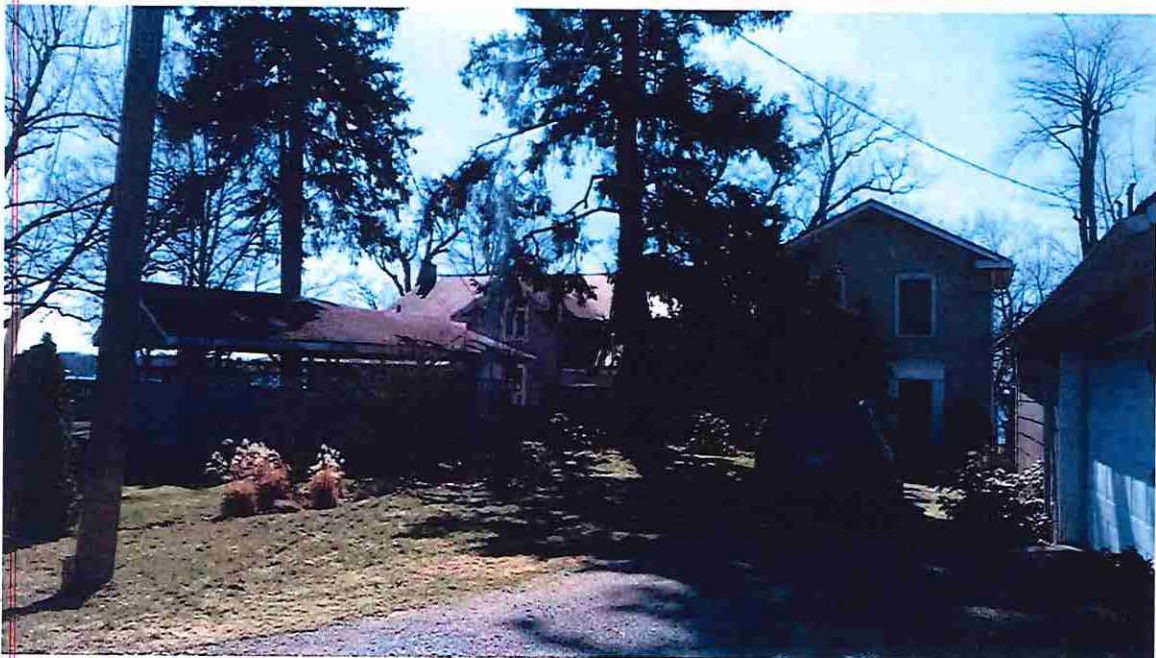
Figure 7: 72 Church Street viewed from the north, with the adjoining 70 Church Street on the left (Edgar Tumak, April 2021).