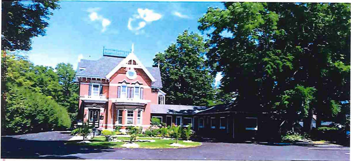
Figure 17: 250 King Street West, originally Woodview Villa, 1874-77, in the High Victorian style, viewed from the south, with motel units from the 1950s on the right (E. Tumak, July 2019).