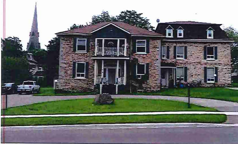
Figure 14: 181 King St. W, Gananoque, with the earlier section on the left with the entrance surround in the Neoclassical manner, and a later wing at the right/west with a Mansard type roof (photo E. Tumak, July 2009).