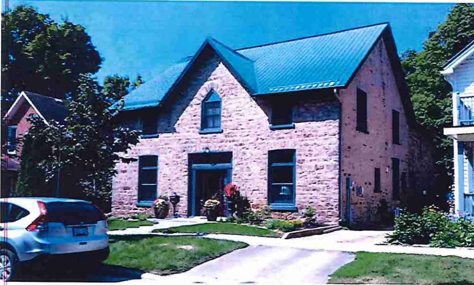
Figure 8: 40 Princess St., the first Christ Church Rectory, viewed from the northeast, built after the first phase of Christ Church 1857-58, enlarged at the rear late 1910s. It is an example of what is often called an Ontario cottage form with embellishments in the Regency style (1830-60) for the door surround and a triangular topped central upper window in a Gothic Revival style mode in keeping with most of the windows of the associated Christ Church.