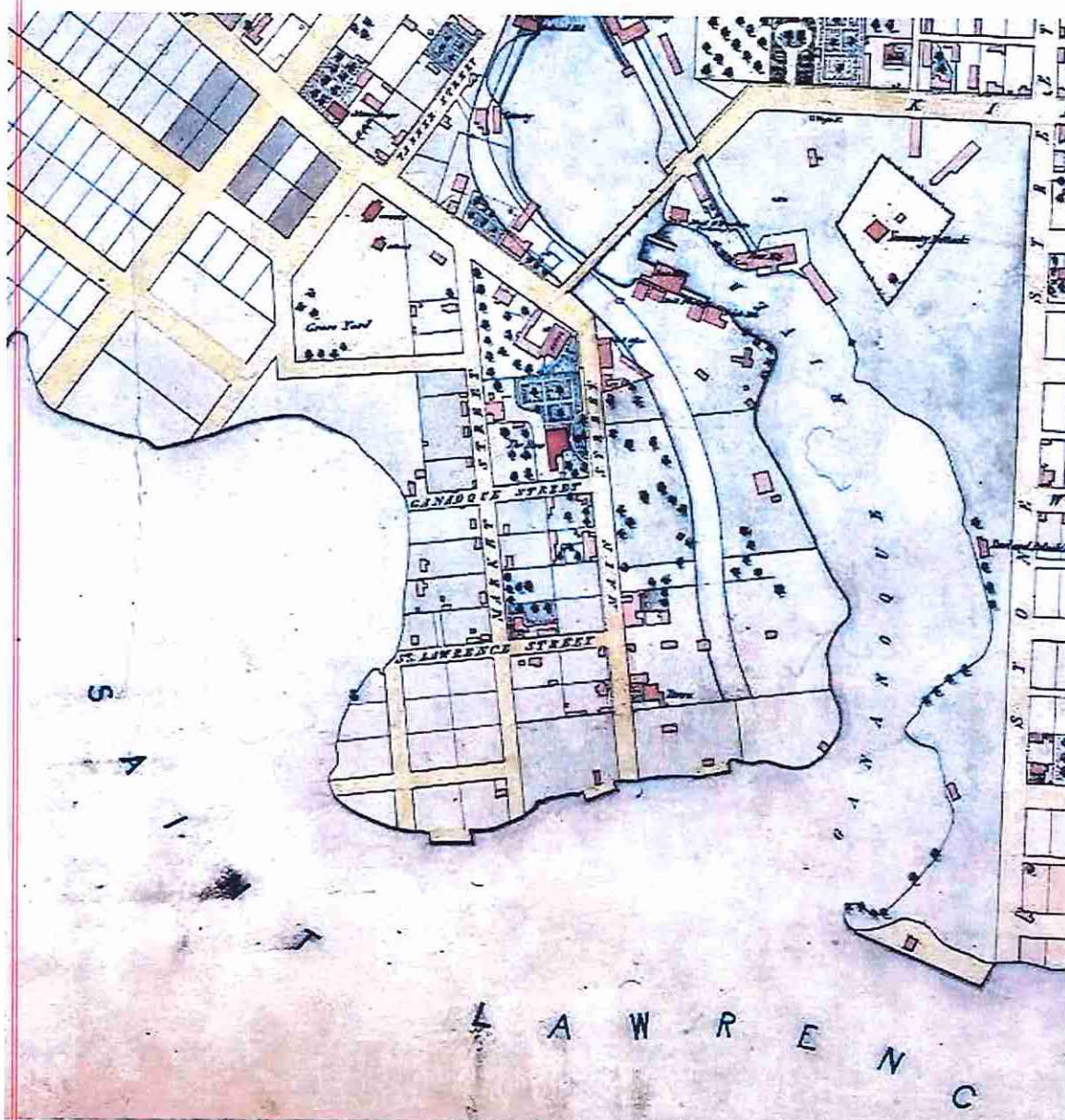
Figure 10: Detail of a plan of Gananoque, dated 1858, but likely composed earlier as not only is Church Street unnamed, but it does not conform to its current southerly alignment with Tanner Street. Further, structures that existed at the time are not shown (e.g., Christ Church, and the Beaumont residence). However, the location of the "Grave Yard" on which 11 Church Street sits (upper left corner), and a church and school at the juncture of King Street, opposite Tanner, are shown.