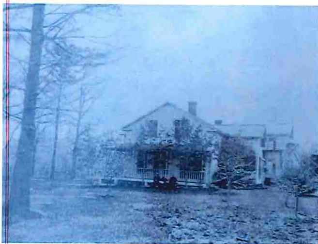
Figure 5: 70 Church Street, Beaumont Residence, built ca. mid-1850s, viewed from the east ca. 1900 with an adjoining component of what became 72 Church Street under construction on the far right/west. As seen below, the residence features windows with a triangulated top similar to Christ Church (image provided by the owner of 72 Church Street, source unknown).

The construction of Christ Church was preceded by Beaumont House at the southern terminus of Church Street erected a few years before, making the Beaumont residence one of the oldest, if not oldest structure on the street. The original iteration of Beaumont House conforms to what now has the civic address of 70 Church Street, while the later attached west portion (with the separate civic address of 72 Church Street) is likely from ca. 1900. The Beaumonts were an early successful family that was not a direct line with the Stone-McDonald clan – the founding settler family of Gananoque. As neighbours and adherents of the English Church, the Beaumonts made their home available for the reception that followed the opening of Christ Church. 3 Another early structure in the immediate area, is the first rectory for Christ Church which was constructed immediately to the east of the church on Princess Street (no. 40).