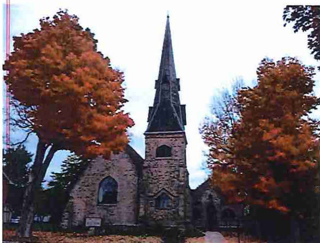
Figure 12: 30 Church Street, Christ Church, viewed from the east, with the nave (1857-58) on the south/left, tower and spire in the centre (spire completed 1880), and the parish hall on the north/right (1901), built in the Gothic Revival style but with most window heads unusually featuring a triangulated top rather than a curved pointed arch (photo E. Tumak, Oct. 2009).

Properties from the third quarter of the 19 th century on Church, Princess and King streets illustrate the development of which 11 Church Street was part, although it was neither the earliest or grandest of houses constructed in this area at the time or shortly thereafter (see Figures 12-19).