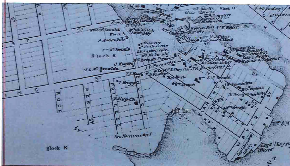
Figure 9: Detail of a plan of Gananoque, ca. 1858. The location of the English Church is noted just below centre (albeit not to scale or exact footprint), but not 11 Church Street, and neither the cemetery nor the union church on the east (right) side of Church Street at King (Illustrated Historical Atlas of the Counties of Leeds and Grenville, Canada West, from actual Surveys under the Direction of H.F. Walling (Kingston: Putnam & Walling Publishers, 1861-62, reprint ed. Belleville: Mika Publishing, 1973), p. 20.