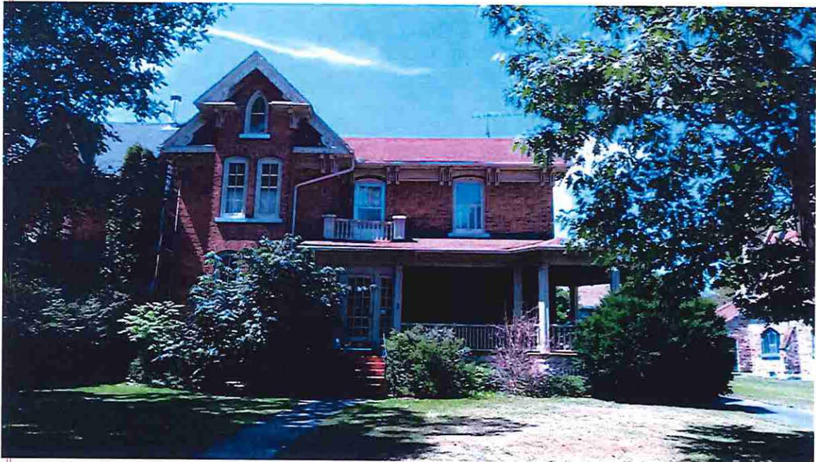
Figure 16: 40 Church Street, viewed from the east, showing Italianate references (paired eave brackets and segmental window arches) and Queen Anne Revival style projecting bay on the south (left) topped by a pointed arch window at the third level window (E. Tumak, July 2019).