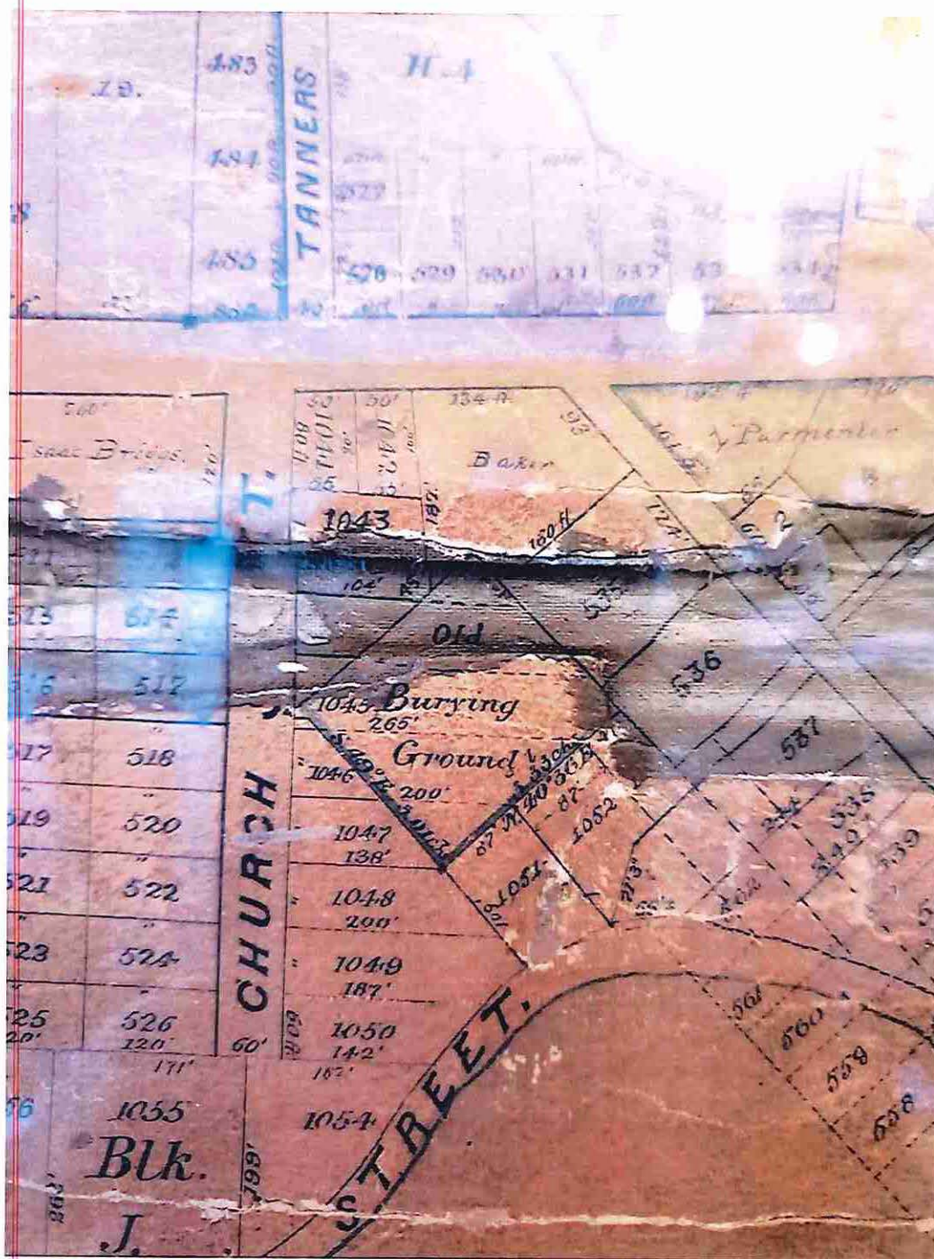
Figure 11: Detail of development Plan 86, showing the "Old Burying Ground" in the lower centre, and the overlap of the cemetery with lot 1043 (Map of the Incorporated Town of Gananoque in the Township and County of Leeds, Ontario, 1885, original displayed in the Planning Dept., Town of Gananoque, 2020).