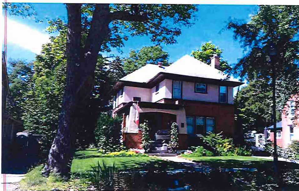
Figure 19: 16 Princess Street, second Christ Church Rectory, ca. 1900, viewed from the southeast.