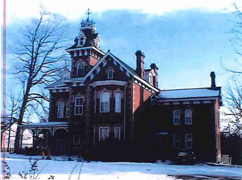
Figure 18: 279 King Street West, viewed from the northwest, former Samuel McCammon residence, 1872, in the Italian Villa style.