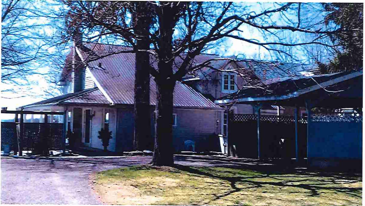
Figure 6: 70 Church Street viewed from the north, showing the triangular topped upper level window just right of centre (Edgar Tumak, April 2021).