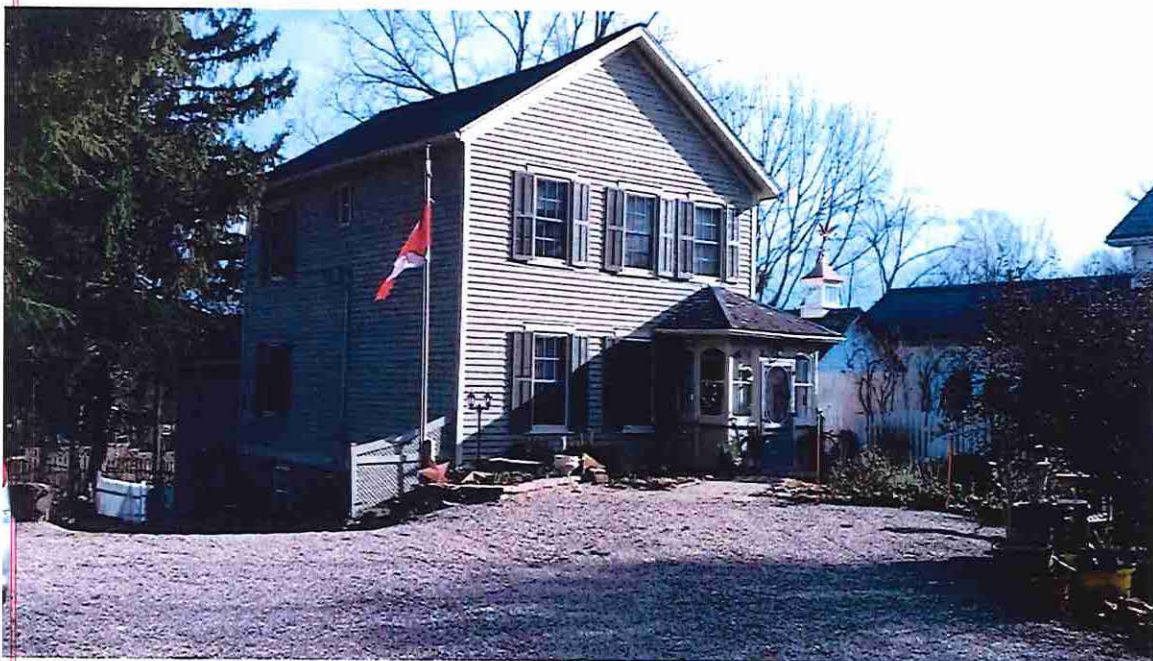
Figure 20: 11 Church Street, Gananoque, viewed from the northwest (E. Tumak, Nov. 2020).