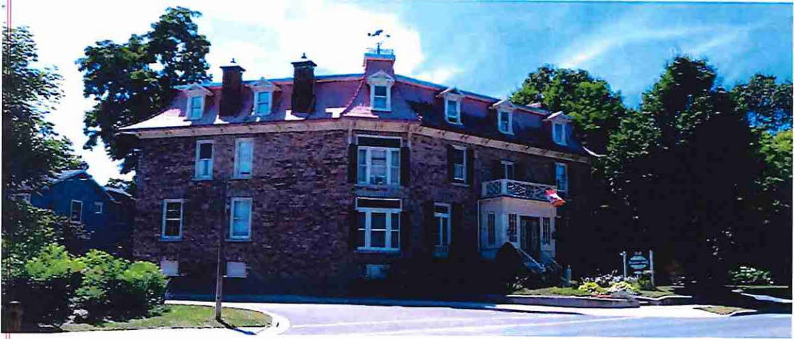
Figure 13: 75 King Street West, viewed from the northeast, originally the residence of Captain Chrysler, 1826, it was substantially modified in the 1870s 5 with notable additions from this later time being the corner pavilion with its wide windows and the bell cast mansard roof.