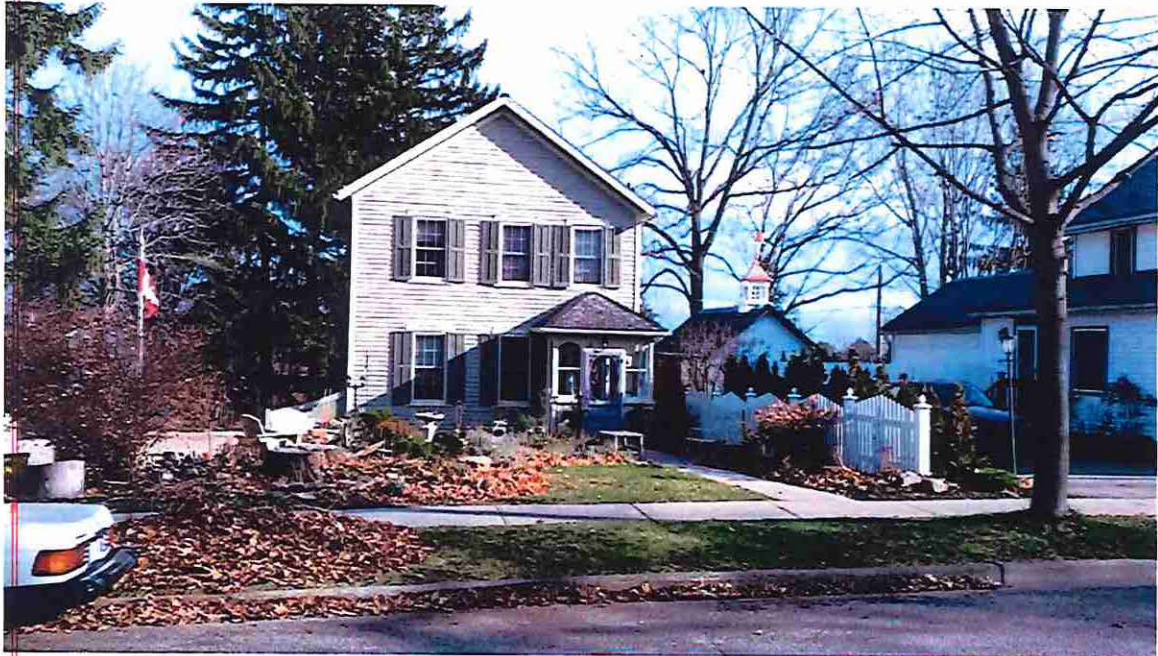
Figure 1: Front elevation, 11 Church Street, Gananoque, viewed from the west.

HERITAGE ANALYSIS REPORT: REAPPRAISAL, by Edgar Tumak Heritage, 2021, Architectural Historian, MSc Architecture, CAHP