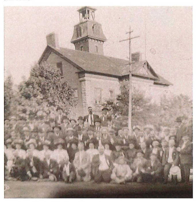
3 Town Hall c.1897. Heritage House Museum.