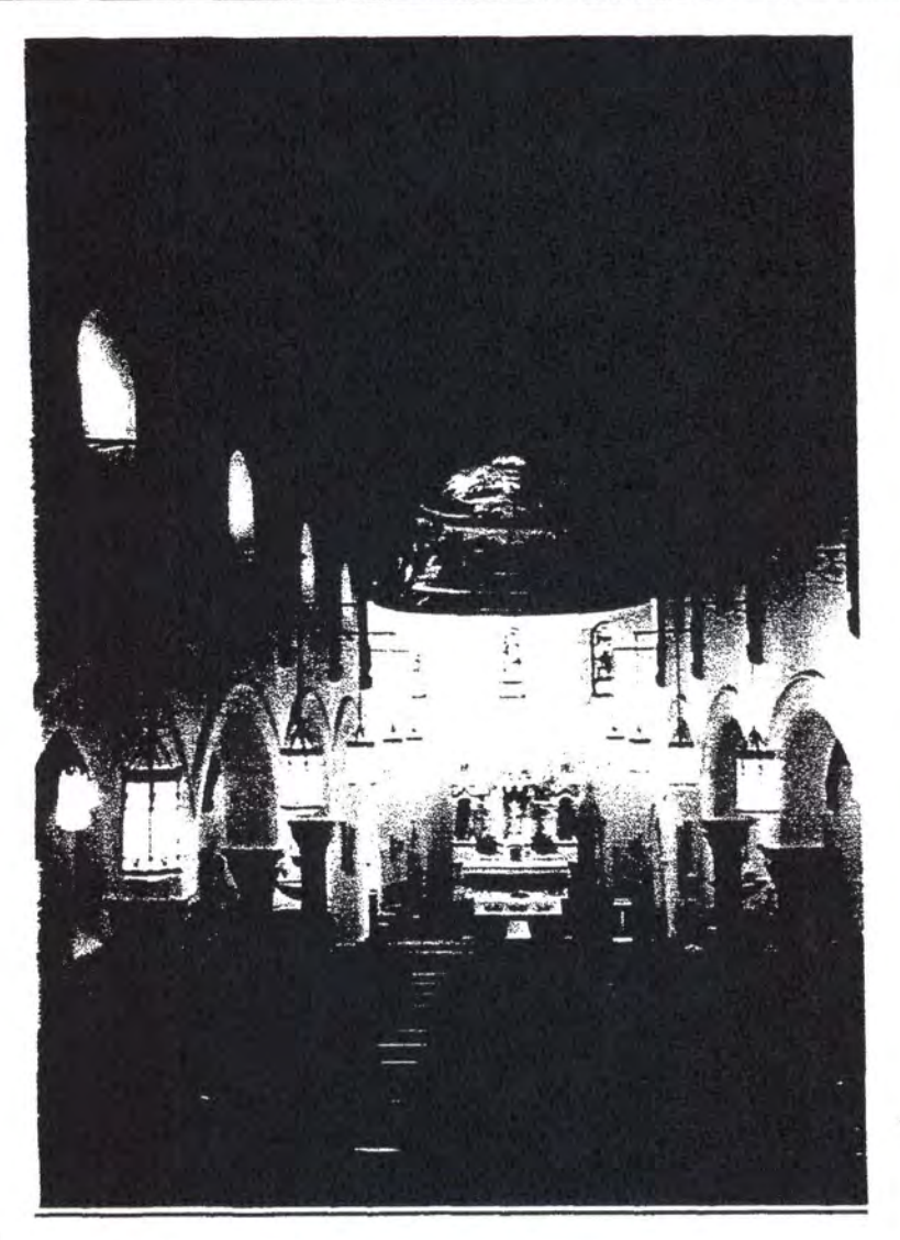
Fig.5 The Nave and Altar