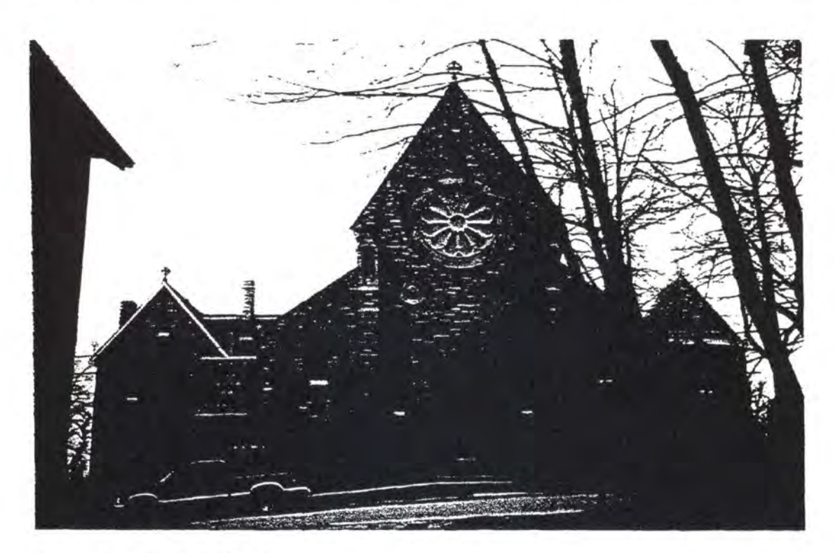
Fig.2 Front Elevation (Façade)

The building is constructed of local limestone, rock faced and skillfully laid in a broken ashlar pattern. The quoins of the main entrance and the fine carved detailing at the façade are, however, rubbed smooth creating an effective contrast to the rock-faced background (Fig.2.).