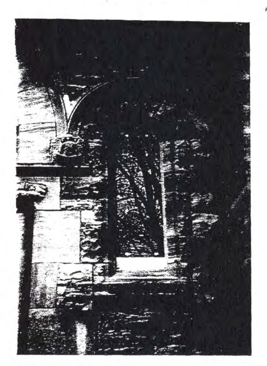
Fig.4 Carved bosses and sill terminations

The interior is thoroughly integrated with the exterior treatment, most obvious in the round arches supported by massive columns which creates an arcade between the nave and the aisles. The stained glass windows are of a very high quality, particularly five windows at the west wall executed by Daprato Statuary Co., of Chicago and New York. Much of the rest of the work appears to be by the N.T. Lyon Studio, Toronto. Other key interior features are the 'Raphael' fresco above the high altar and the marble high altar itself imported from Italy c.1915.