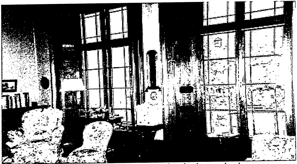
Interior: showing window surrounds and walnut woodwork