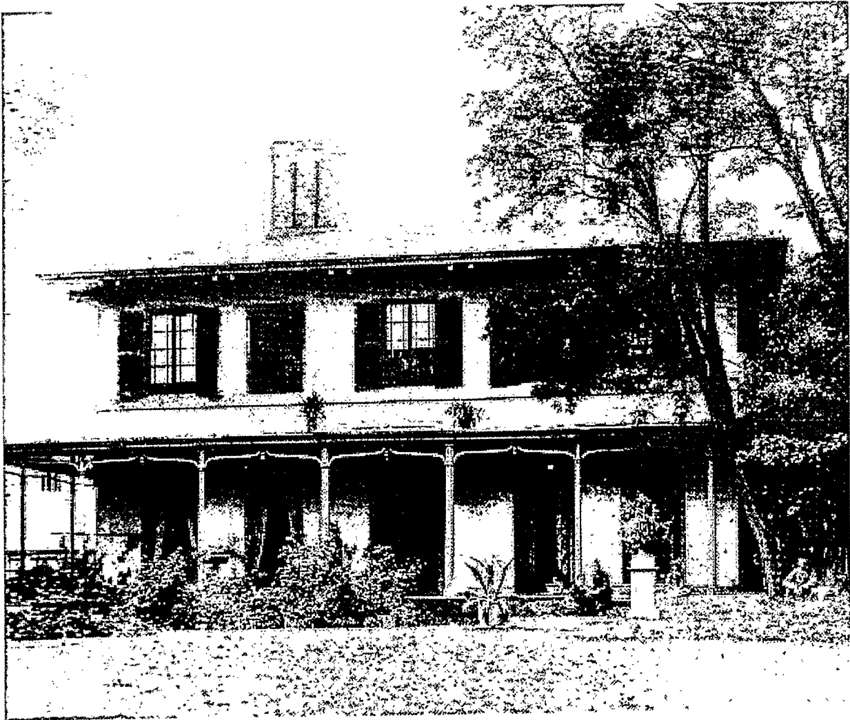
"WOODLAWN"/WILLIAM HUME BLAKE HOUSE 35 WOODLAWN AVENUE WEST, TORONTO, WARD 22