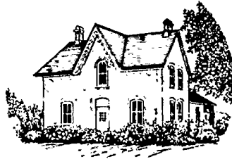
BIRTHPLACE OF FORMER PRIME MINISTER DIFENBAKER Neustadt, Ontario N0G 2M0