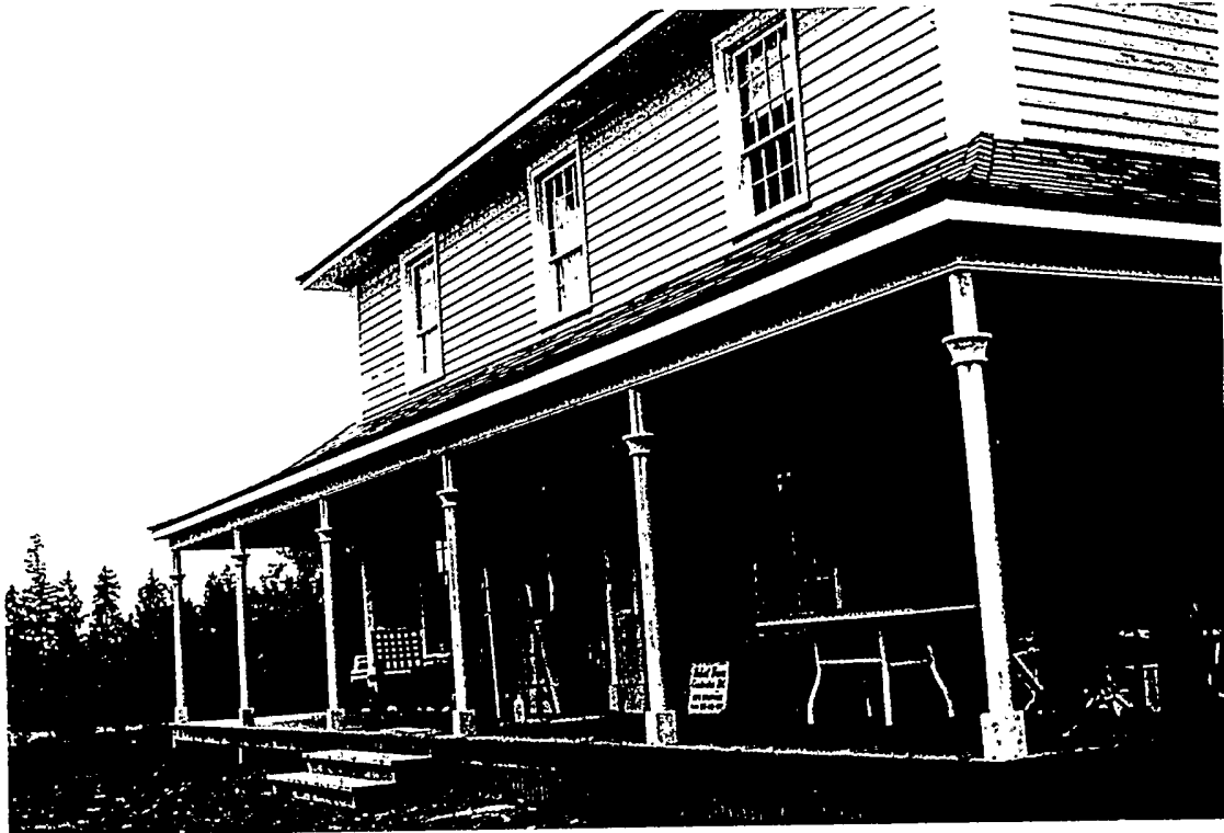
PHOTOGRAPHS OF THE GAPPER-DUNCAN AT 6 WISMER PLACE