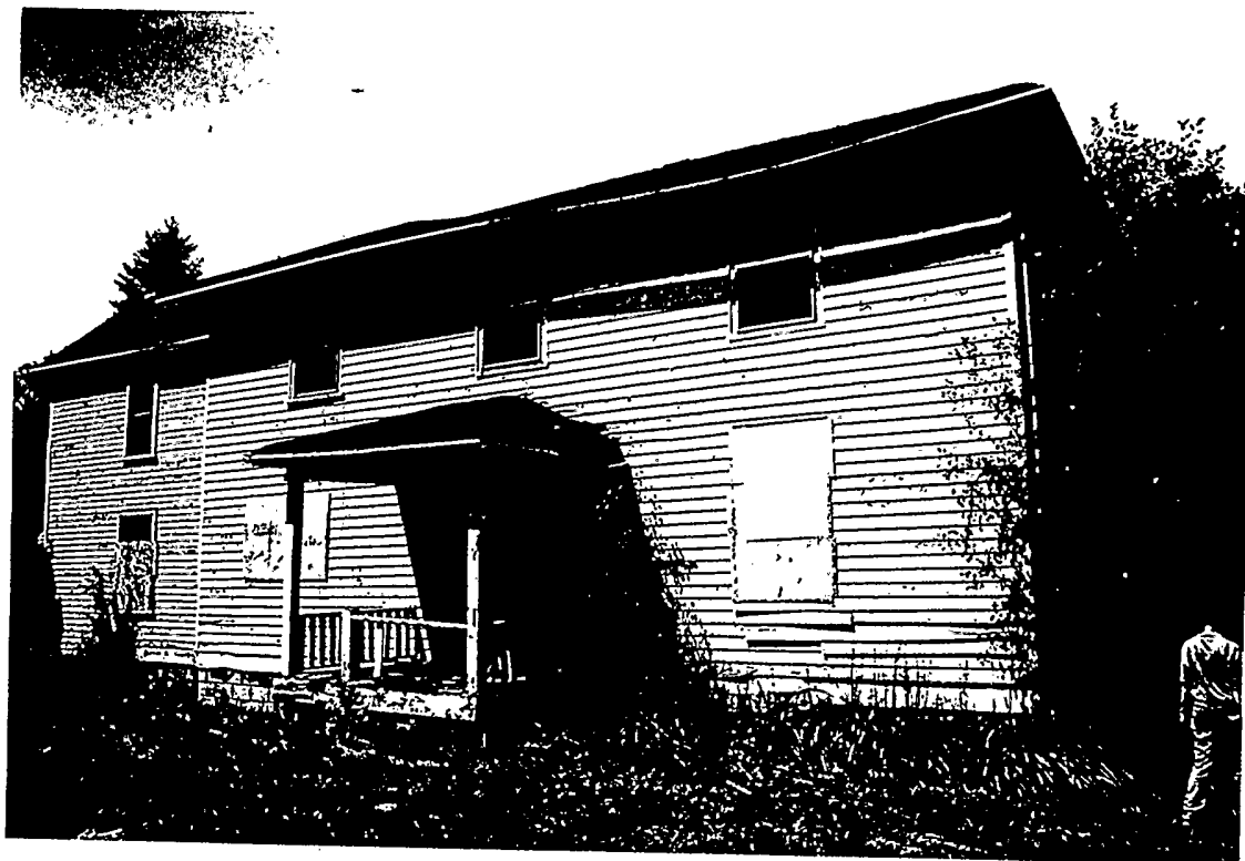
PHOTOGRAPHS OF THE GAPPER-DUNCAN HOUSE, 1990s