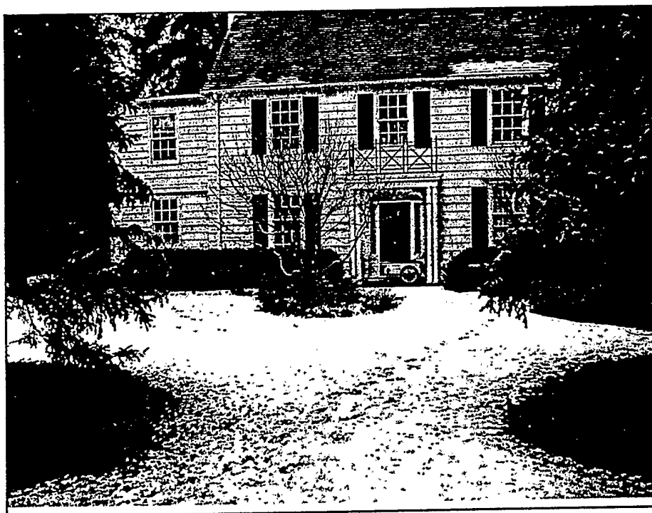
"ALDEBARRON" The Jim Murray House 7070 Bayview Avenue Part Lot 1, Concession 2 Hamlet of Fish's Mills