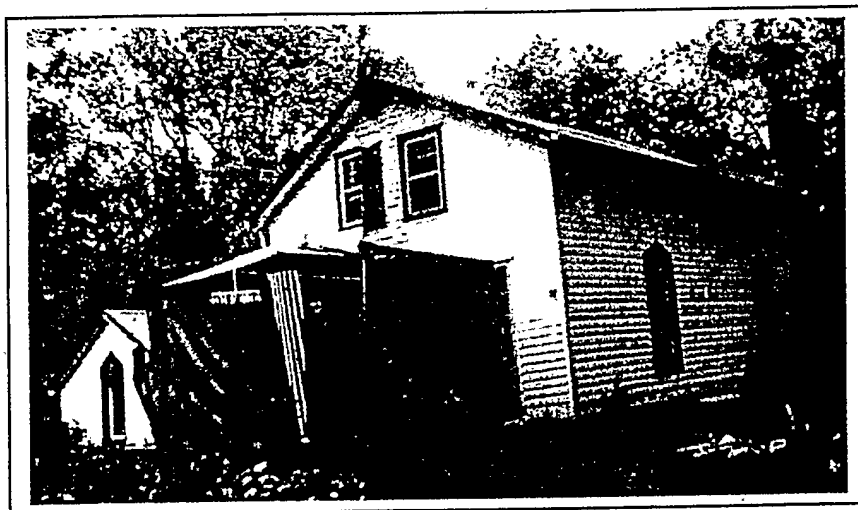
THE DAVID WHALEY HOUSE 7218 Reesor Road Lot 2, Concession 9