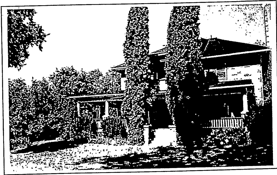
THE SAMUEL REESOR HOMESTEAD 7450 Reesor Road Lot 4, Concession 9