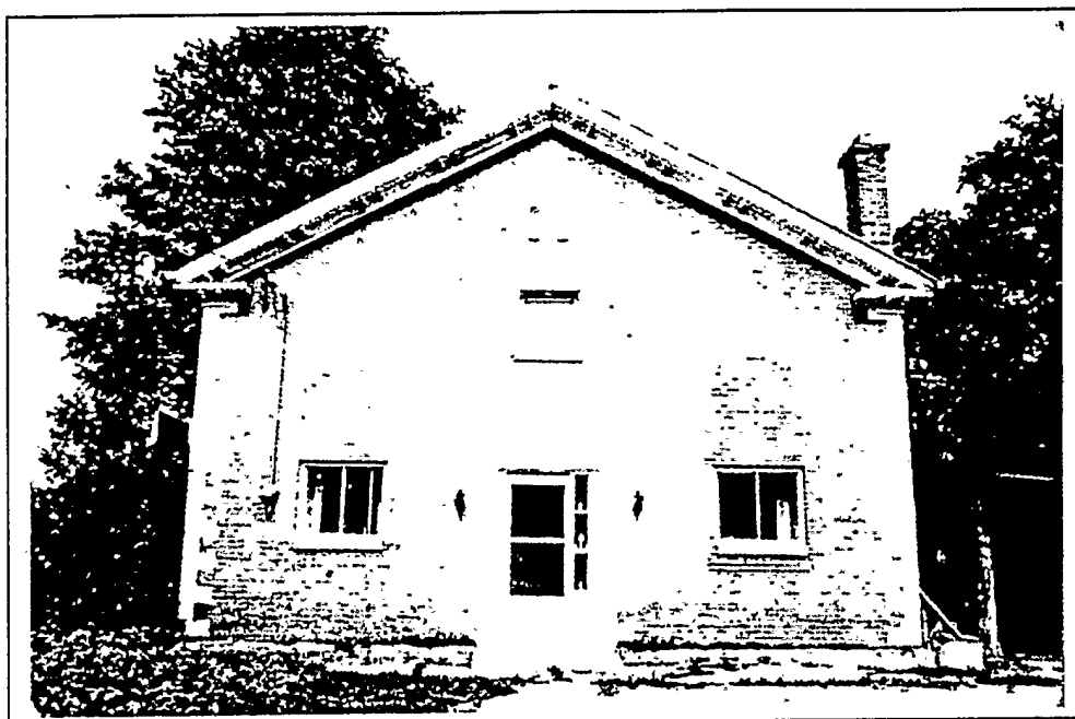
LOCUST HILL SCHOOLHOUSE SCHOOL SECTION #21 8949 Reesor Road Part Lot 13, Concession 10 Inventory # K5 - 11