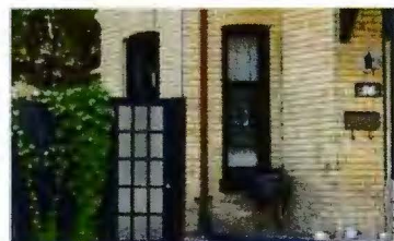
9. Wood windows and storms