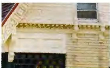
13. Bracket course below the window openings