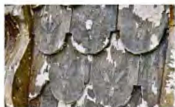
15. Square and scalloped wood shingle imbrication. Note: unpainted sample shown.