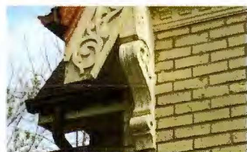
12. Pierced details in the corbels/consols