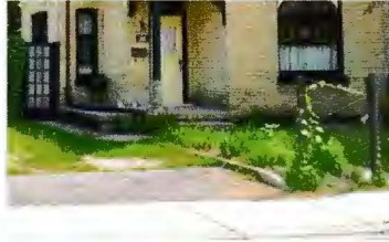
2. Seback of the building from Pegler Street