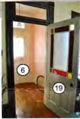
19. Vestibule door (interior)