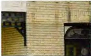
4. Buff brick veneer exterior cladding, with voussoirs above the window and door openings