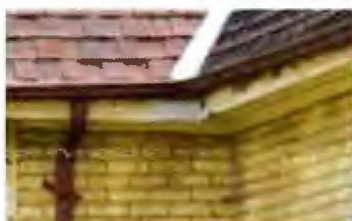
17. Wood tongue and groove soffits