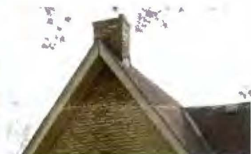
18. Buff brick chimney