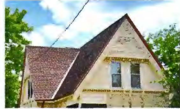
3. Steeply pitched cross-gable roof