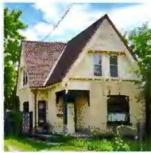
1. Form, scale, and massing of the one-and-a-half store L-plan residential building