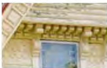
14. Bracket course above the window openings