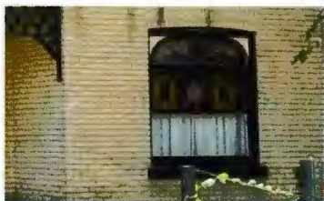
7. Large plate glass window with transom and trim/surround