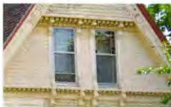
8. Queen Anne style windows