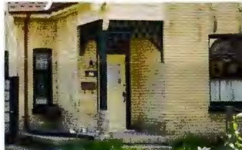
5. Entry doorway set in an umbrage with decorated fluted wood post with brackets and fretwork