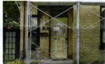
6. East Lake style painted wood door with glass lights, brass ringer/bell and mail slot, and transom