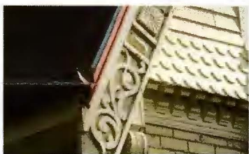
10. Bargeboard with naturalistic foliated scroll motif