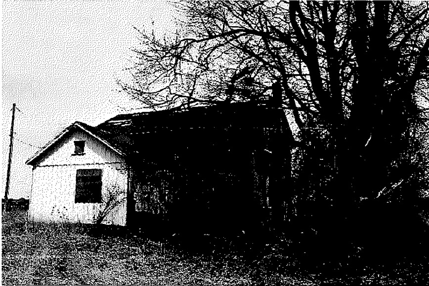
Figure 4: South Façade, taken by Chris Lemon, Parslow Heritage Consultancy 2021