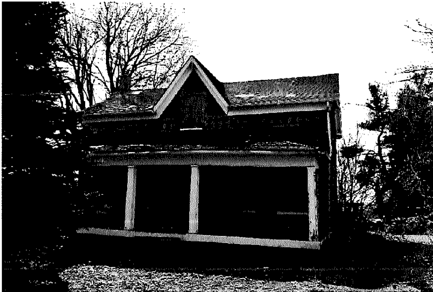
Figure 2: North and East Façade