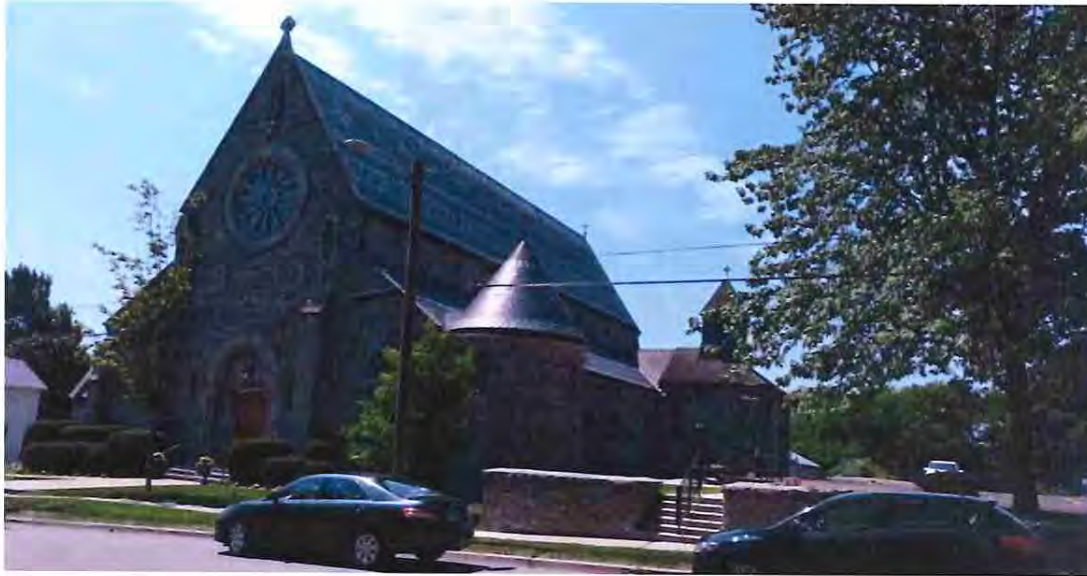
Figure 24: St. John's, viewed from the northeast with the former baptistry on the right foreground and the bell 'tower' and belfry on the right background (E. Tumak, July 2019).

The Clock Tower and Post Office formed part of the former Market Square. Gone from this campus are the Fire Hall (demolished 1974), water tower (demolished 1979), and Gananoque High School (built 1898, demolished 1974). The three-storey brick Riverview Apartments of 1975 (architect M. Paul Wiegand, Belleville), on the grounds of the former Market Square, is the only non-conforming structure of note in what is essentially a heritage precinct. However, with large trees along the street and its narrow end facing Stone Street South, it is not dissimilar in its streetscape effect vis-à-vis the presence of the former High School with two storeys and an attic which formerly was a little to the south. 20