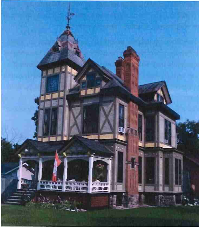
Figure 17: 375 King Street West, Brockville, viewed from the northwest (E. Tumak, July 2021).

The only other example of the Eastlake style in Gananoque is located at 167 Brock Street, of which the sole expression is conveyed by the rectilinear corner bay and the diagonally set wood panelling flanking the window. If there was greater expression of the style on the Brock Street residence this was lost with later asbestos shingle recladding.