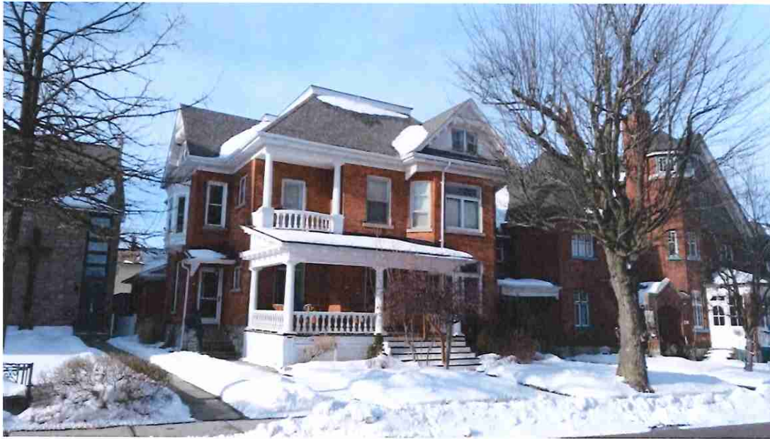
Figure 8: 128 Pine Street, viewed from the southwest with Grace United Church to the left and 136-38 Pine Street to the right.