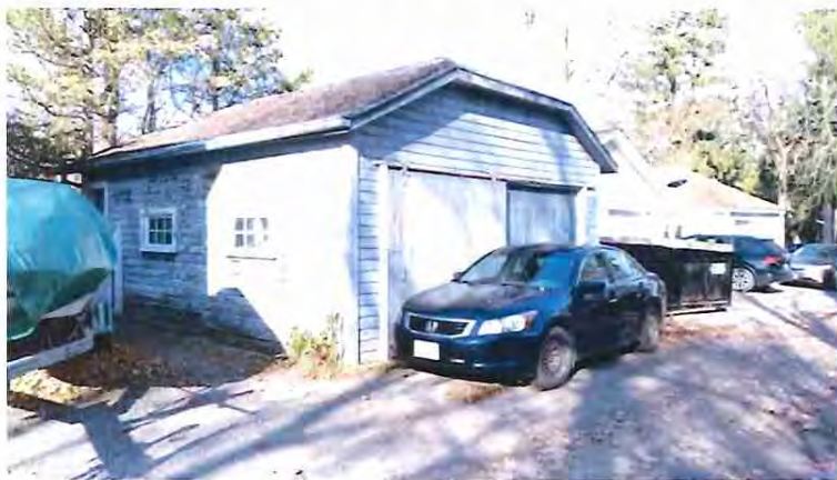
Figure 16: 145 Stone Street South, Gananoque, garage at east/rear end of property fronting onto Spruce Alley (E. Tumak, Nov. 2020).