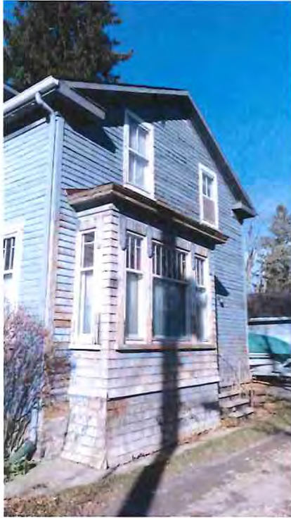
Figure 15: 145 Stone Street South, Gananoque, rear/original portion of ca. 1830 with 1884-85 bay window addition, viewed from the southwest facing Spruce Alley (E. Tumak, Nov. 2020).