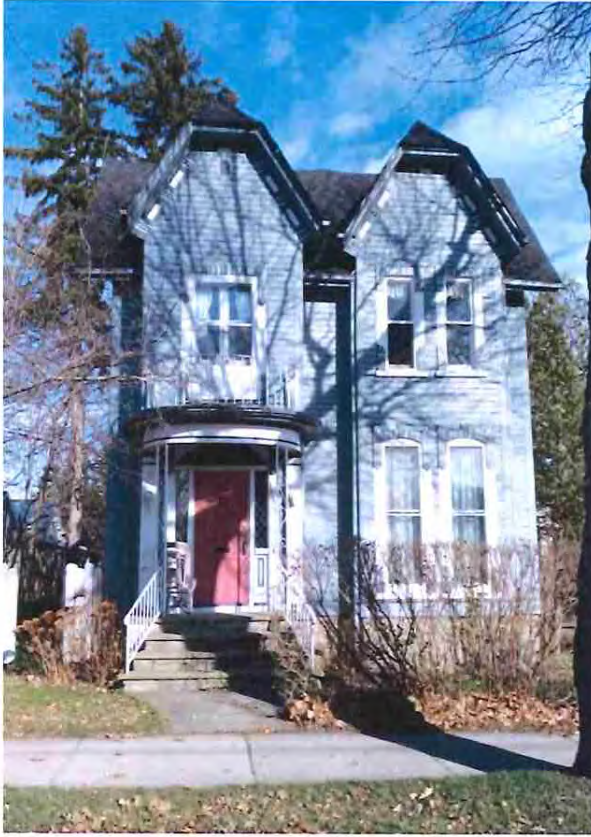
Figure 13: Front elevation, 145 Stone Street South, Gananoque, viewed from the west (E. Tumak, Nov. 2020).