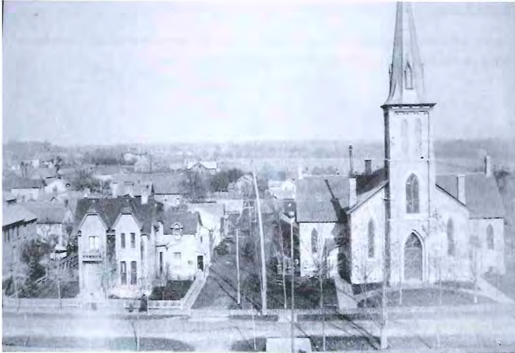
Figure 20: 145 Stone Street South (left) and St. Andrew's (right/south) viewed from the former Gananoque Public High School on the opposite side of Stone Street South (demolished 1974), n.d. The photo shows the main entrance access featuring the original swoop, or double-curve, splayed knee walls to the door (see also Figure 12), with a balcony above protecting the entrance from the elements (photo n.s., n.d.: A History of Gananoque: The Story of the Town with Photographs, presented by the Museum Board, Gananoque, 1986).