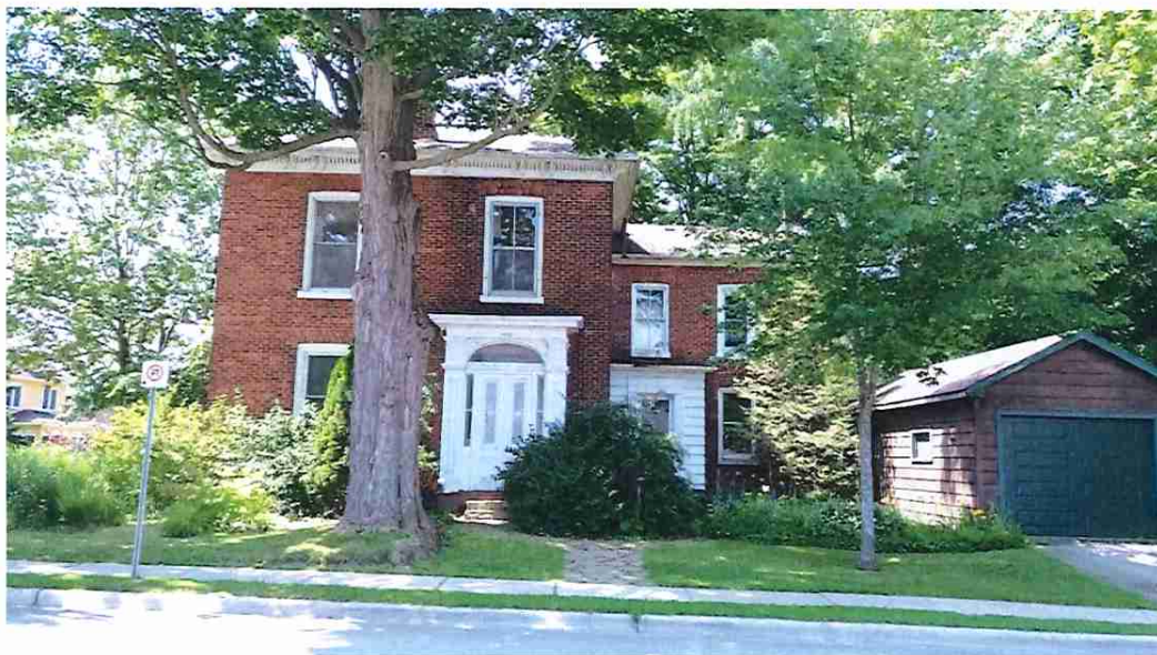
Figure 4: 480 Charles Street South, viewed from the east.