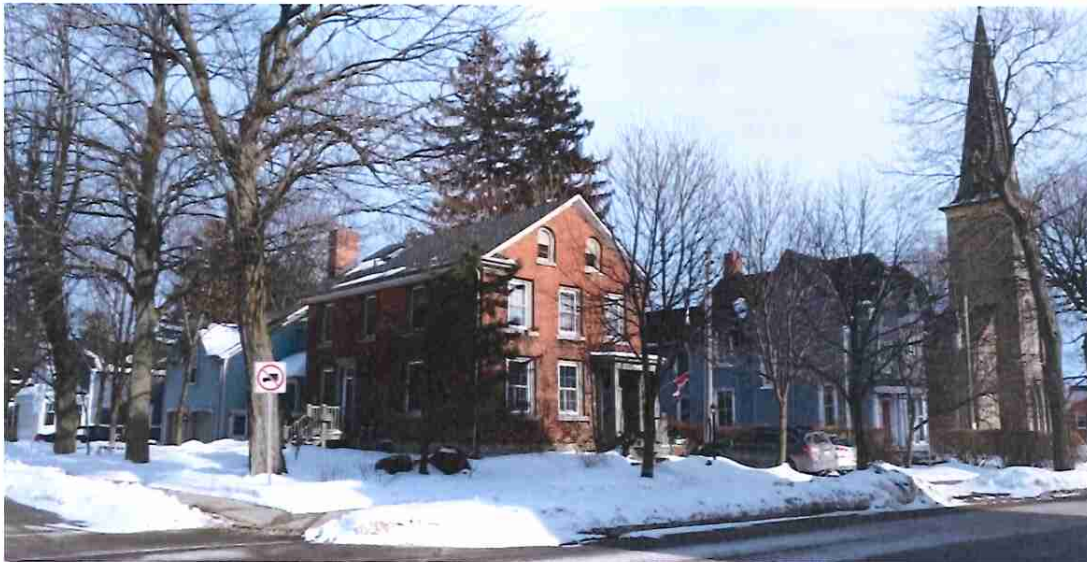
Figure 9: 125 and 145 Stone Street South (left and middle respectively), and St. Andrew's Presbyterian Church (right), viewed from the northwest.