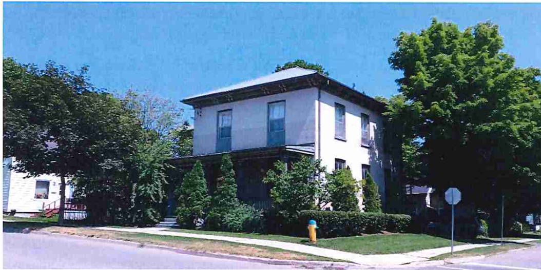
Figure 3: 295 Stone Street South, Gananoque, viewed from the southwest. The separate side entrance is partially visible on the left (E. Tumak, July 2019).