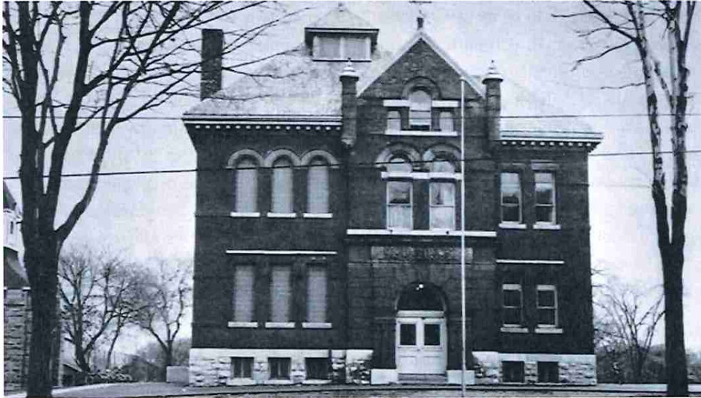
Figure 25: St. John's School (former Gananoque Public High School), ca. 1968