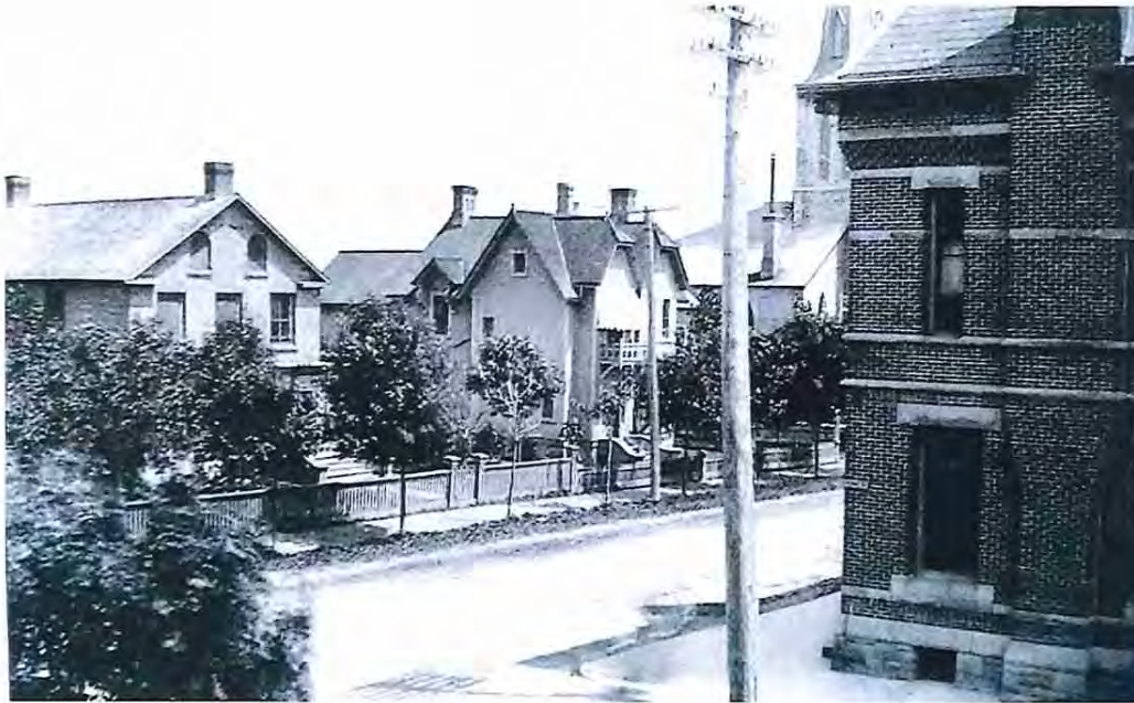
Figure 10: 125 and 145 Stone Street South (left and middle respectively), and St. Andrew's Presbyterian Church (right background), viewed from the northwest ca. 1900. One of Gananoque's former post offices is on the far right. It also served as a doctor's office at one point. The most notable change to 145 Stone Street South is the different main entrance access featuring the swoop, or double-curve, splayed knee walls to the door, with a balcony above protecting the entrance from the elements. Also gone are the two forward chimney stacks (Gananoque Historical Society Newsletter, Feb. 2013, no. 59, p. 1599).