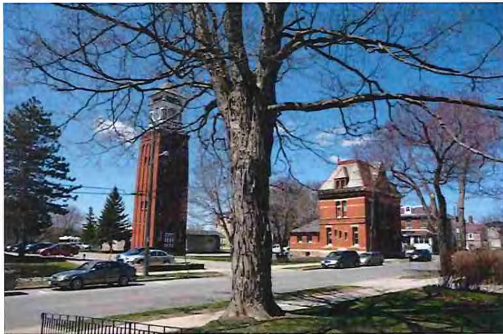
Figure 23: View to west side of Stone Street South, opposite the Dumble House and St. Andrew's Presbyterian Church, showing the Clock Tower on the left and the former Post Office on the right (E. Tumak, May 2015).