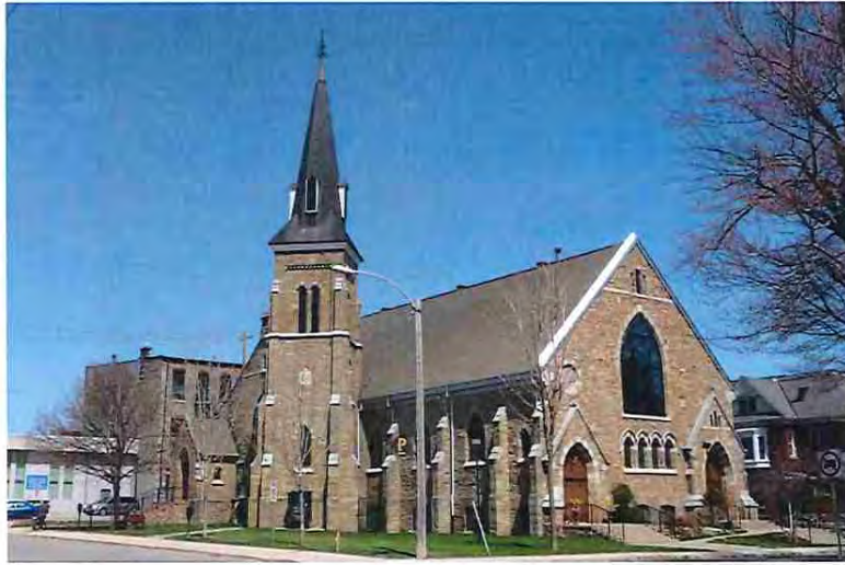
Figure 22: Grace United Church (former Methodist Church), viewed from the southwest (E. Tumak, May 2015).