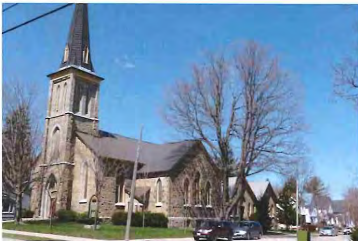
Figure 21: St. Andrew's Presbyterian Church, Gananoque, viewed from the southwest, with the sanctuary on the west/left and the Gracey Hall on the east/right. The Dumble House is partially visible on the far left/north of the church.