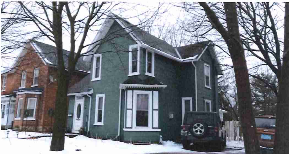
Figure 18: 167 Brock Street viewed from the northwest (E. Tumak, Jan. 2021).

The only other example of the Eastlake style in Gananoque is located at 167 Brock Street, of which the sole expression is conveyed by the rectilinear corner bay and the diagonally set wood panelling flanking the window. If there was greater expression of the style on the Brock Street residence this was lost with later asbestos shingle recladding.