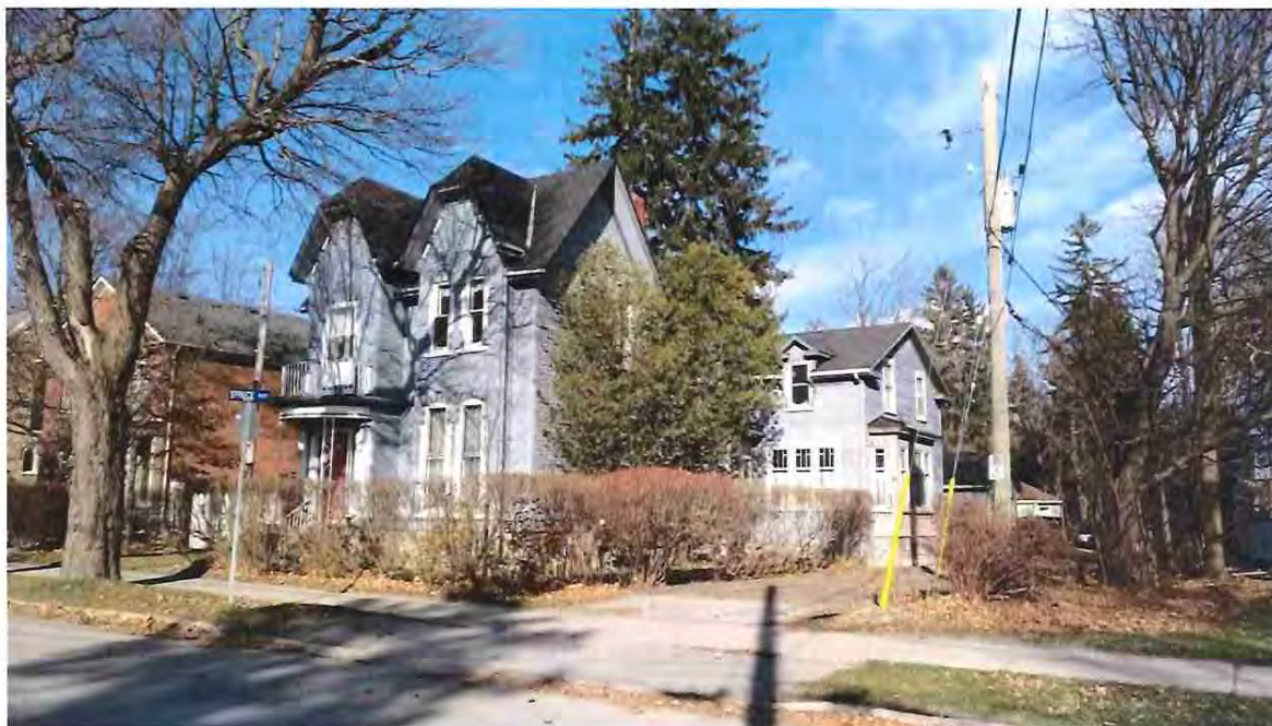
Figure 1: Front (left) and south/side (right) elevation, 145 Stone Street South, Gananoque, viewed from the southwest, with Spruce Alley on the right.