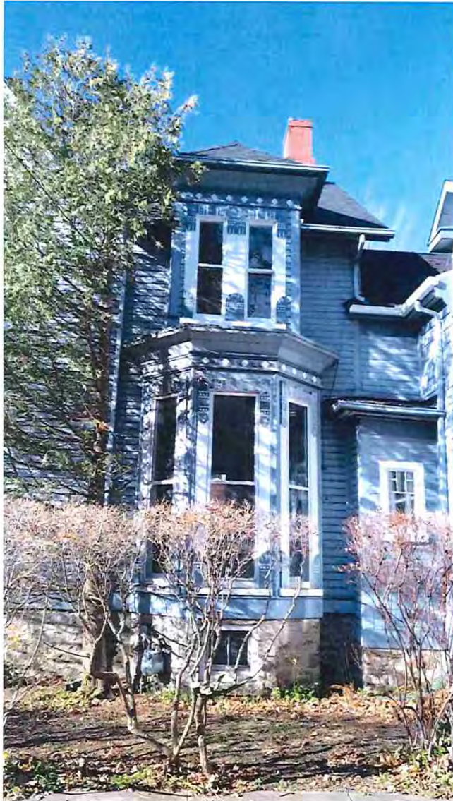
Figure 14: 145 Stone Street South, Gananoque, detail of the two-storey window bay on the south elevation (facing Spruce Alley) showing the 1884-85 portion of the building (E. Tumak, Nov. 2020).