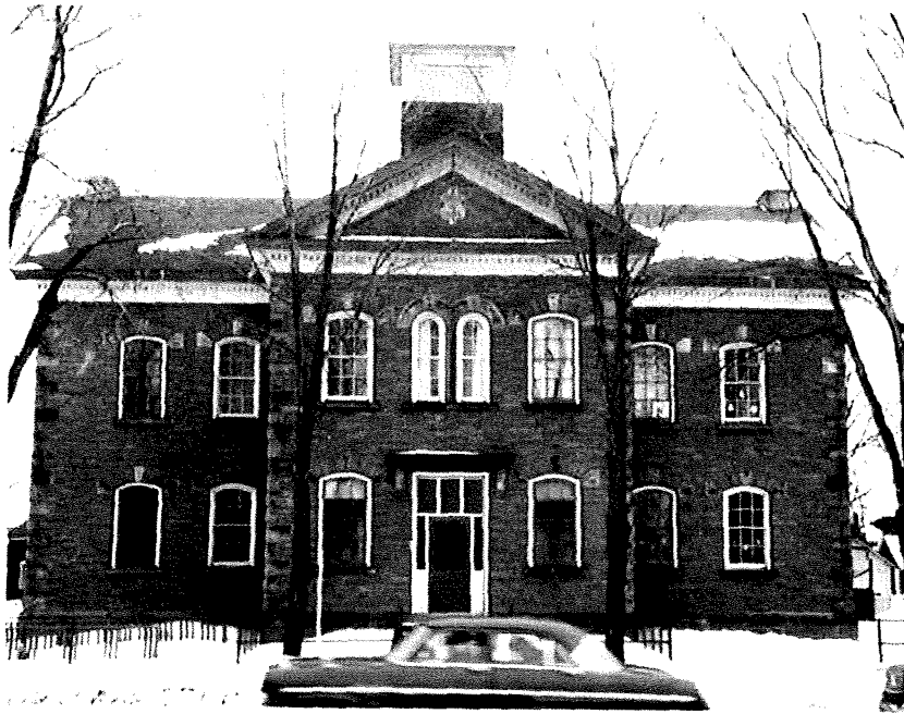
4 Old School House, ca. 1950. Town of Smiths Falls.