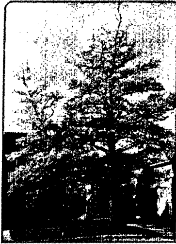
McGuire Tree –Eastern Larch ( Larix laricina )