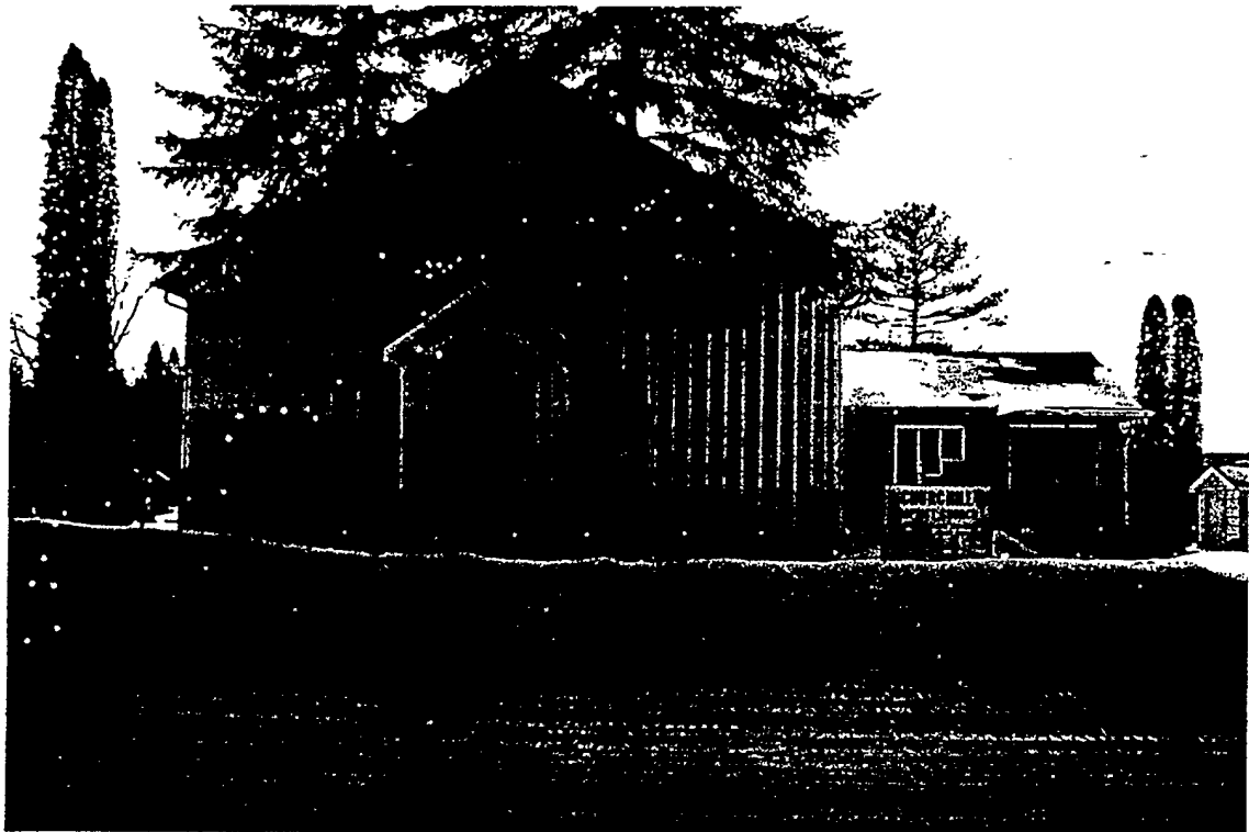
CHURCHILL BAPTIST CHURCH 15336 Ninth Line Lot 21, Concession 8, Former Township of Whitchurch

Prepared by: Heritage Whitchurch-Stouffville April, 1997