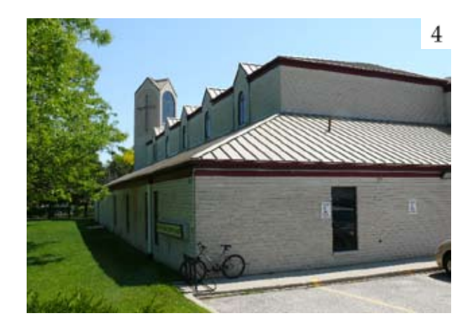
10 Adelaide Street East Toronto, Ontario M5C 1J3

The opposite of the front corner tower, this type is common in Islamic architecture in Ontario. In Christian architecture, the tower is located at the back of the building, either flanking a chancel or centrally marking the change between nave and chancel. Examples: 1. St. Mary's Roman Catholic Church (Fort Francis) 2. Jami Masjid (Brampton), 3. Church of the Good Thief Catholic Church (Kingston), 4. Mennonite Brethren Church (Waterloo)